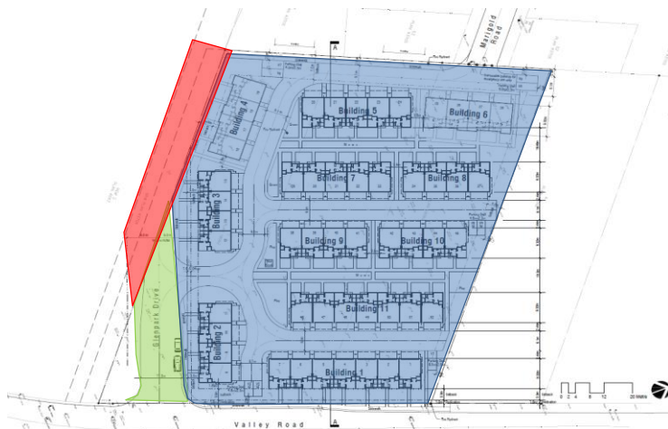
Figure 1 – Blue Indicates the proposal site, Green indicates the portion of Glenpark Drive to be constructed with this development and Red indicates the future Glenpark Drive to be constructed as part of the adjacent future development.

This development will trigger the partial construction of Glenpark Drive and will provide the primary access to the site. The full construction and connection of Glenpark Drive to Drysdale Boulevard would not be completed until the development of 330 Valley Road (property to the south of the subject site).