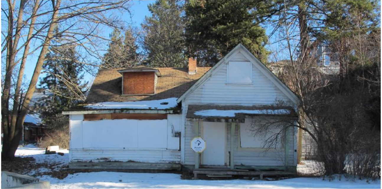
Historic front facade (west elevation) of Surtees House at 4629 Lakeshore Road.