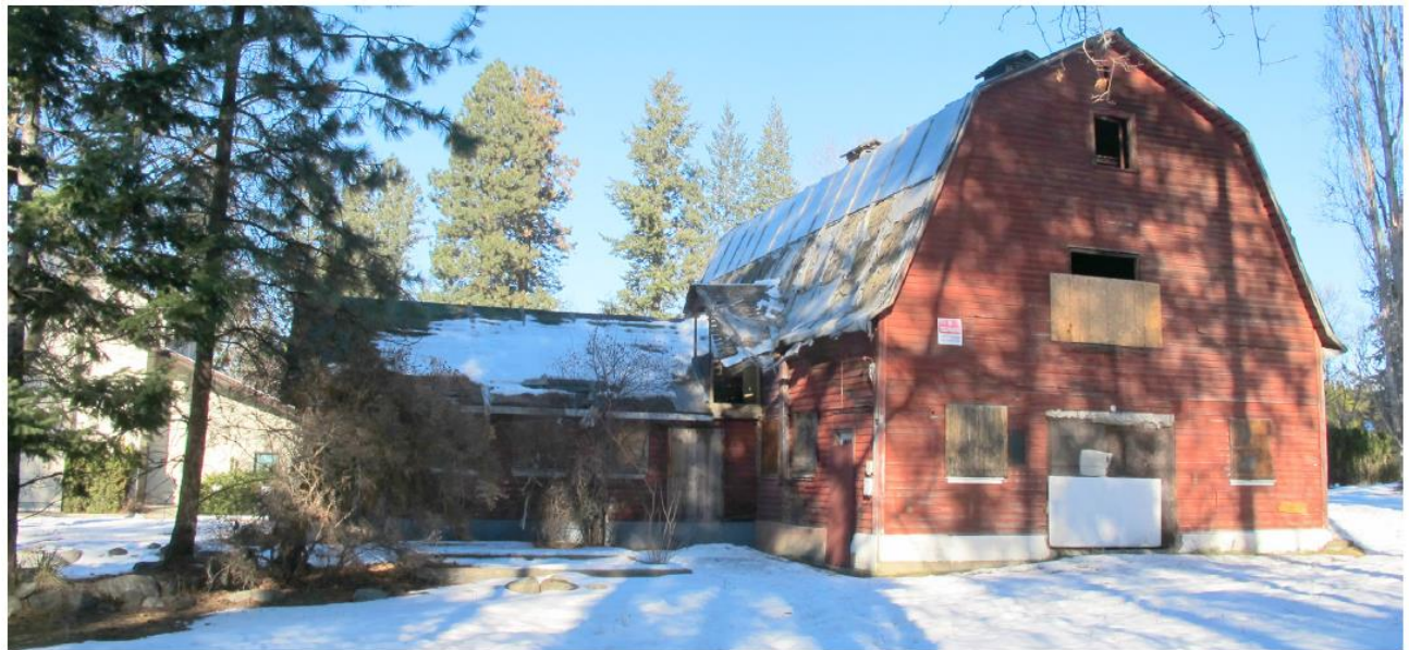
Archival photo showing south elevation of Surtees Barn with cross of church in the background (top; date unknown); photo showing existing condition of Surtees Barn, as viewed from southwest, with St. Andrew's Church in the background.