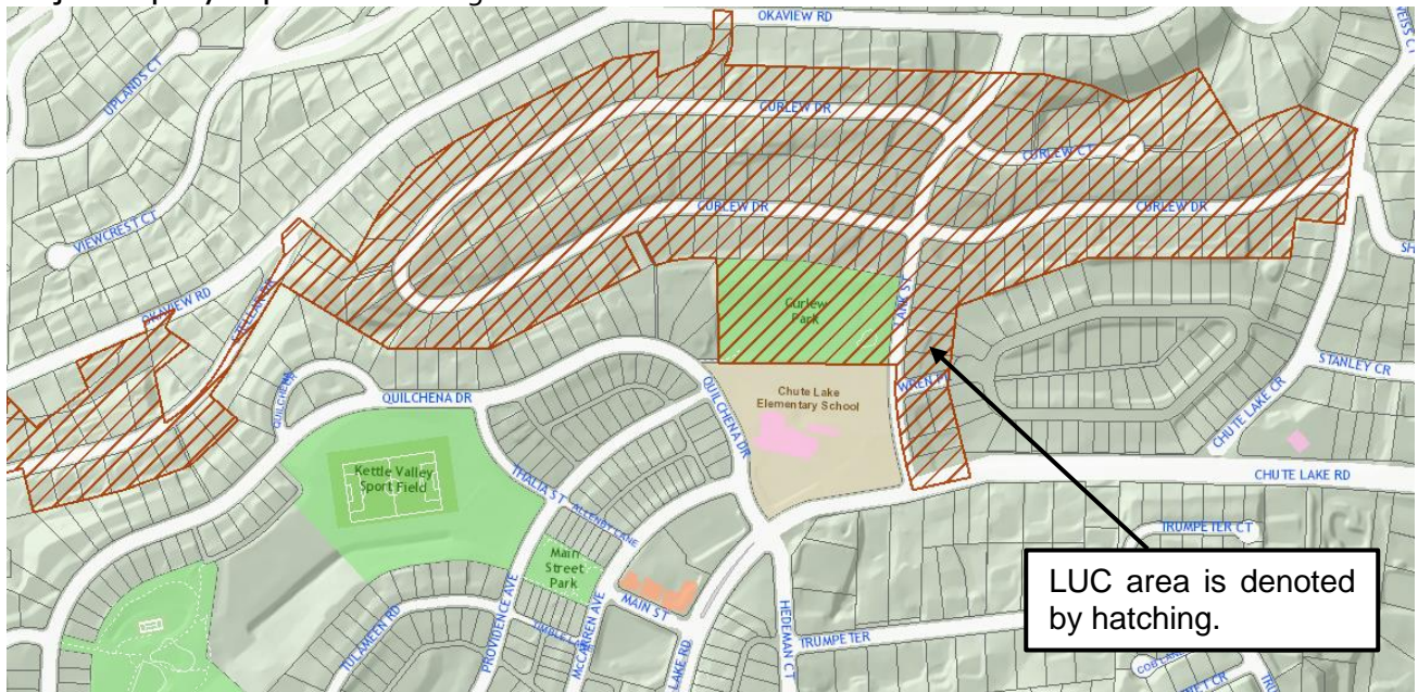
Subject Property Map: South Okanagan Mission Sector