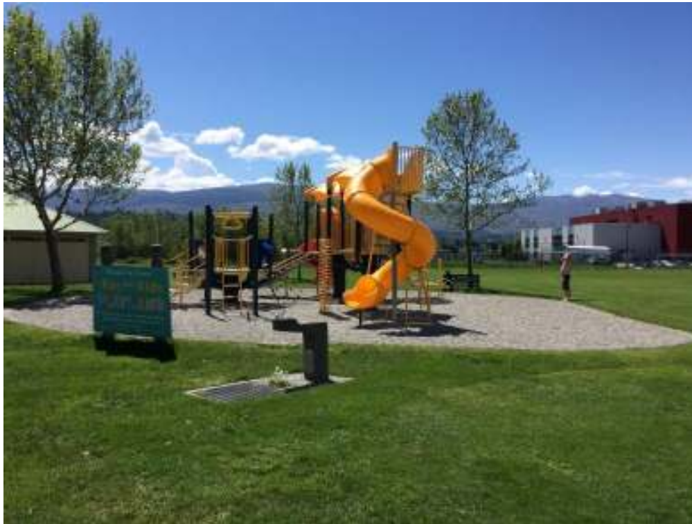
Mission Recreation Park