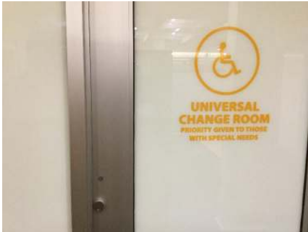
Rutland Family YMCA