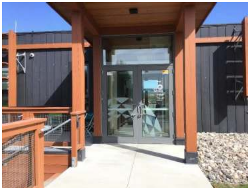
Landfill Administration Building