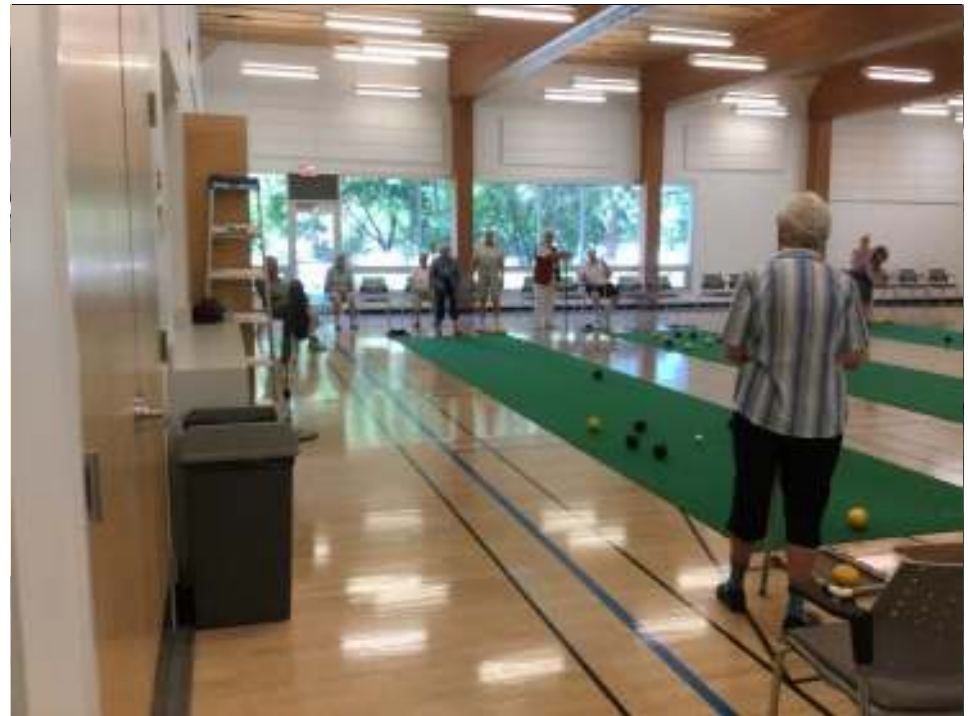
Parkinson Activity Center