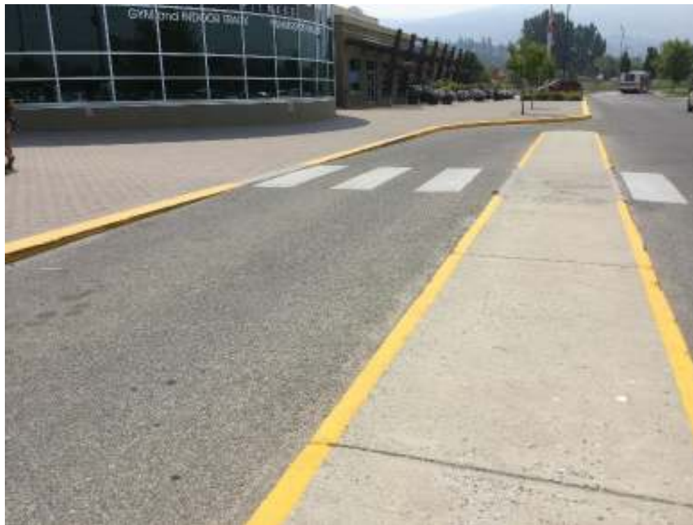
Capital News Center