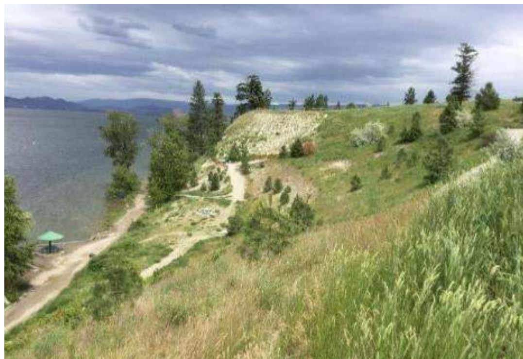
Cedar Creek Park