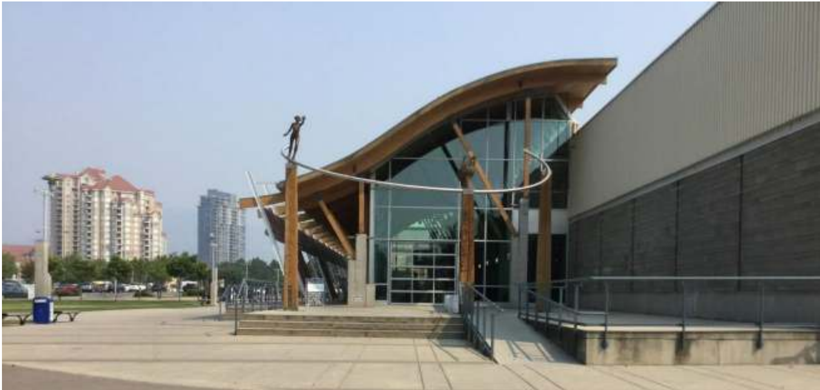
Rotary Centre for the Arts