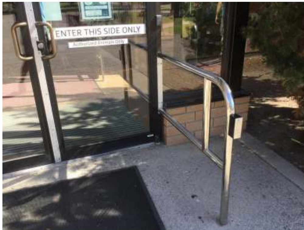
Parkinson Recreation Center