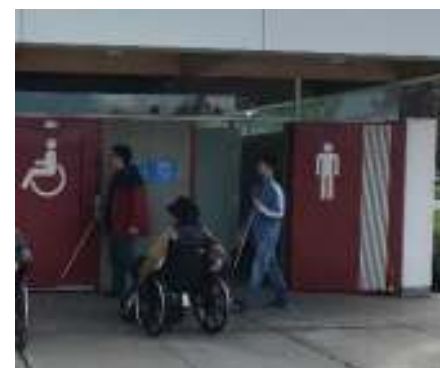
City Park: Staff/stakeholder park experience