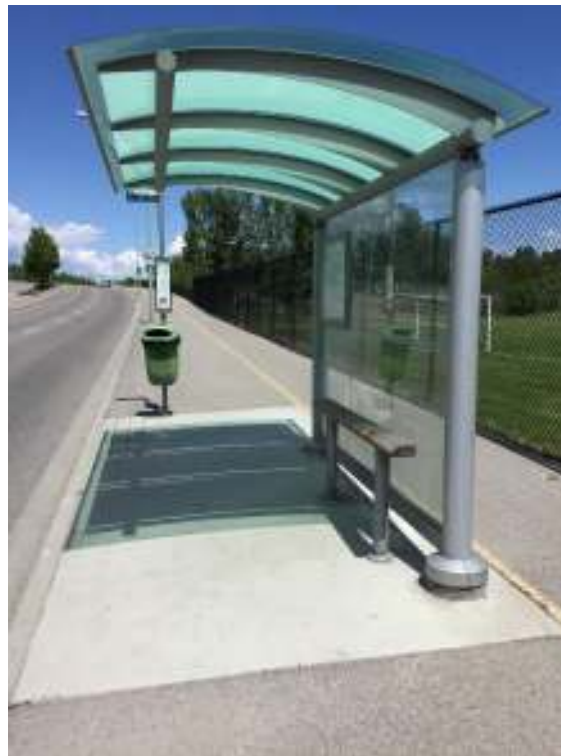
Transit near Mission Recreation Park