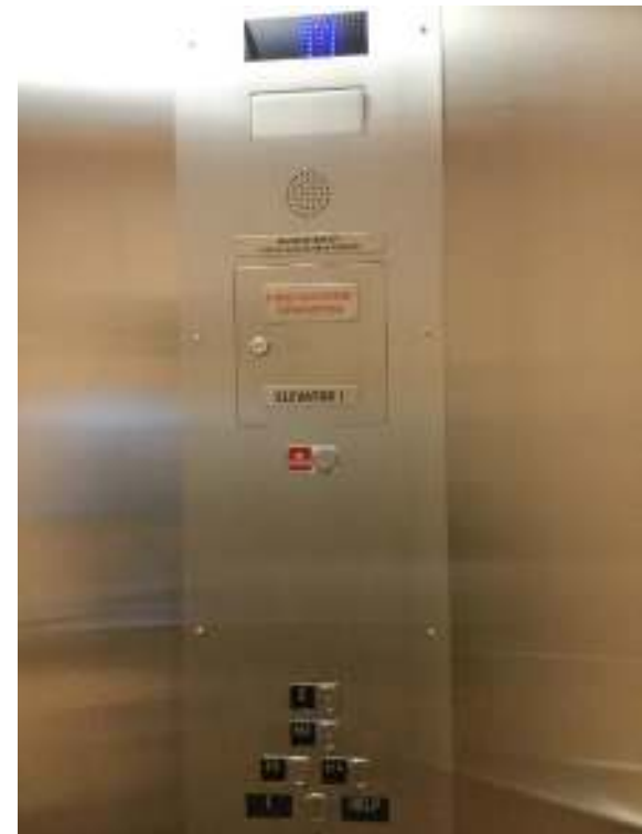
Parkinson Activity Center