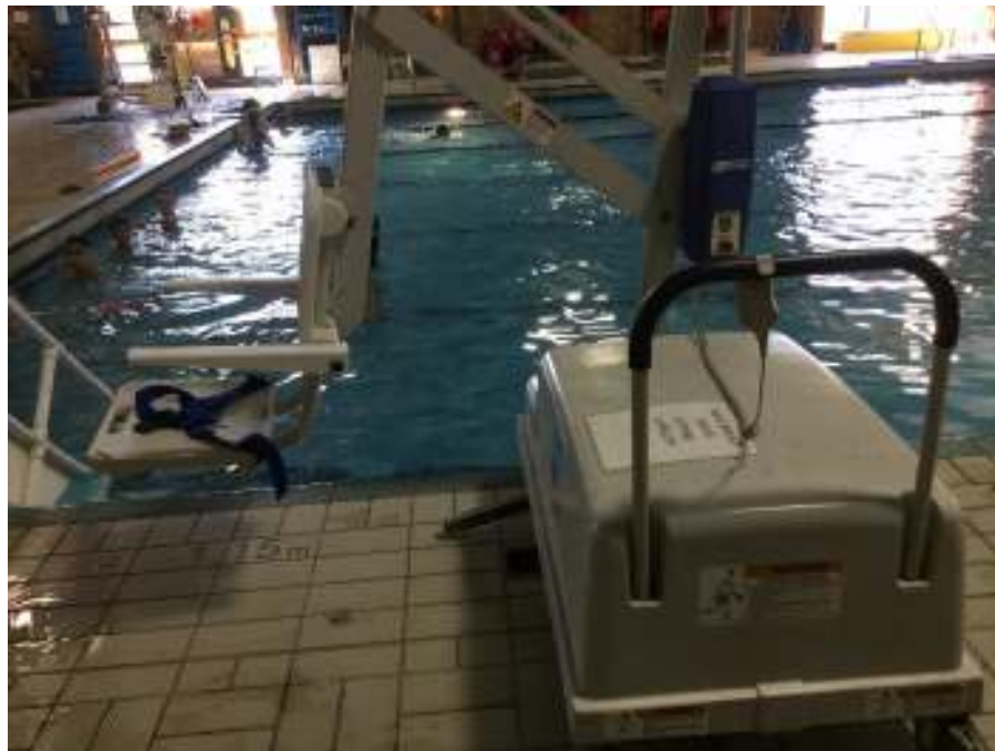
Parkinson Recreation Center