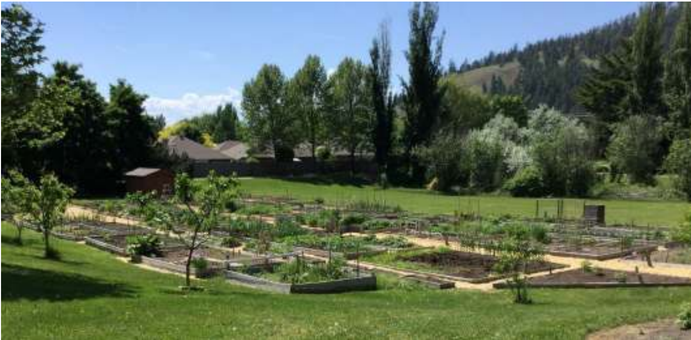
Sutton Glen Community Gardens