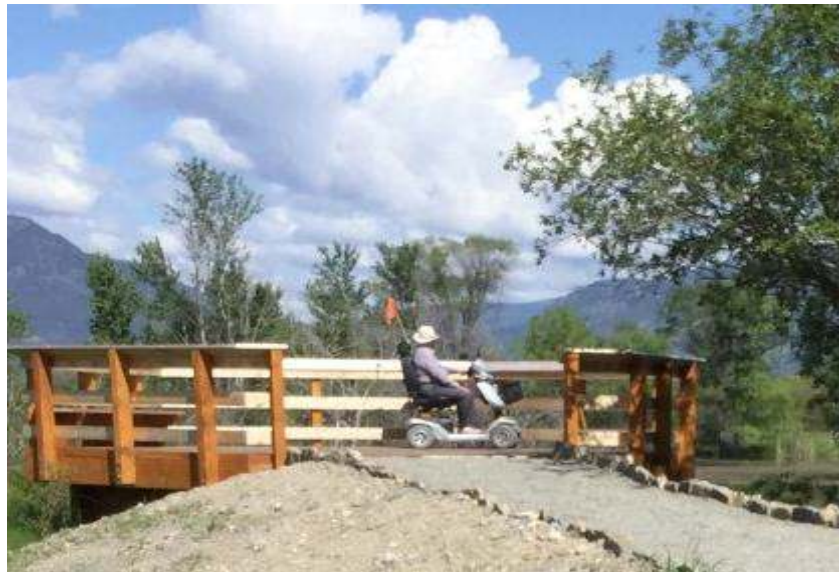
Munson Pond Park

Recommendations for improvement, including prioritization for implementation