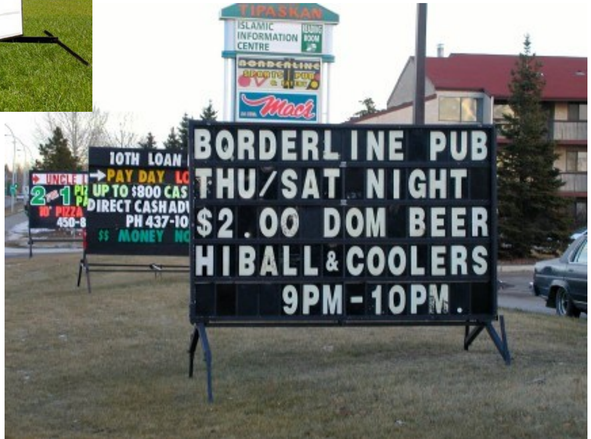
City of Kelowna