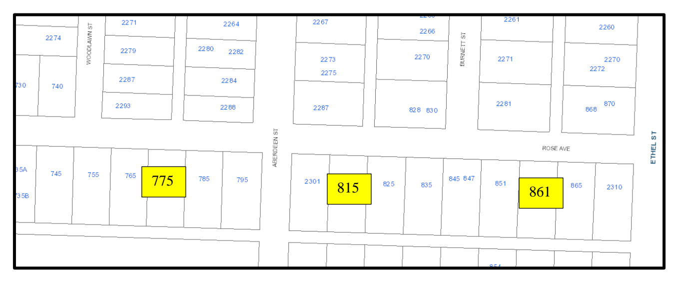
Figure 1.0 – Current Zoning Applications along Rose Avenue.