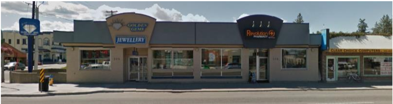
Figure 1. The subject property: 105-115 Hwy 33 W.

The subject property is currently used as a jewelry store and a pharmacy.