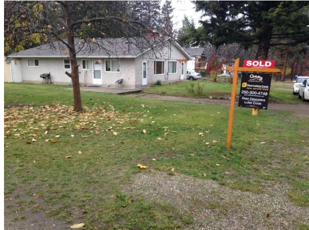
Figure 2 (left). Existing single detached dwelling on the property. Figure 3 (right). Existing duplex on the property.

The rezoning will legalize the existing duplex and facilitate a future 5 lot subdivision ( Attachment A ). All servicing and technical considerations will be managed through a future subdivision and development permit application.