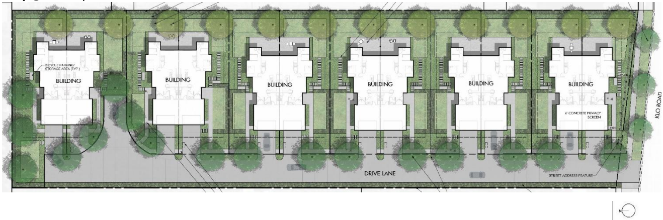
Map 3 Conceptual Site Plan

In order to align with the front property lines of adjacent parcels on both sides, a road dedication in favour of the City is proposed which includes a 6.0m taper from west to east along the full frontage of KLO Road. The applicant is responsible for full frontage upgrades including landscaped boulevard, sidewalks, and any road painting that may result from the corresponding Development Permit. In the RU5 zone, only one dwelling is permitted per strata lot and secondary suites are not permitted.