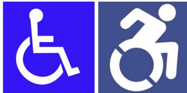
Figure 5-1: International Symbol of Access

Old symbol (left) and new symbol (right)