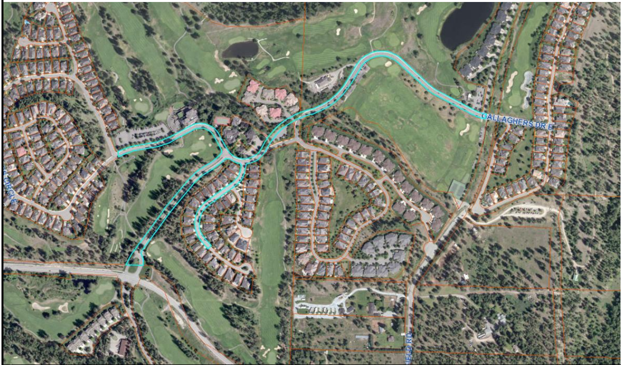
Appendix C: Map "8" Address: Gallaghers Canyon Blvd