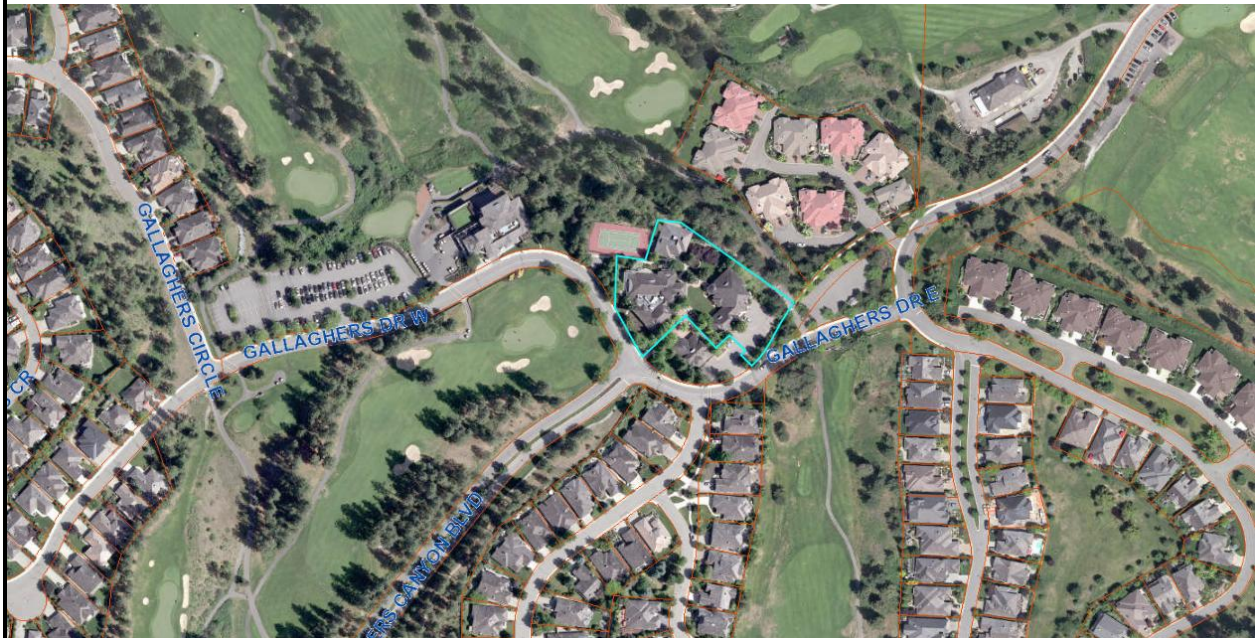
Appendix C: Map "6"