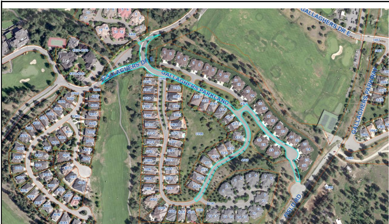
Appendix C: Map "1" Address: Gallagher's Parkland