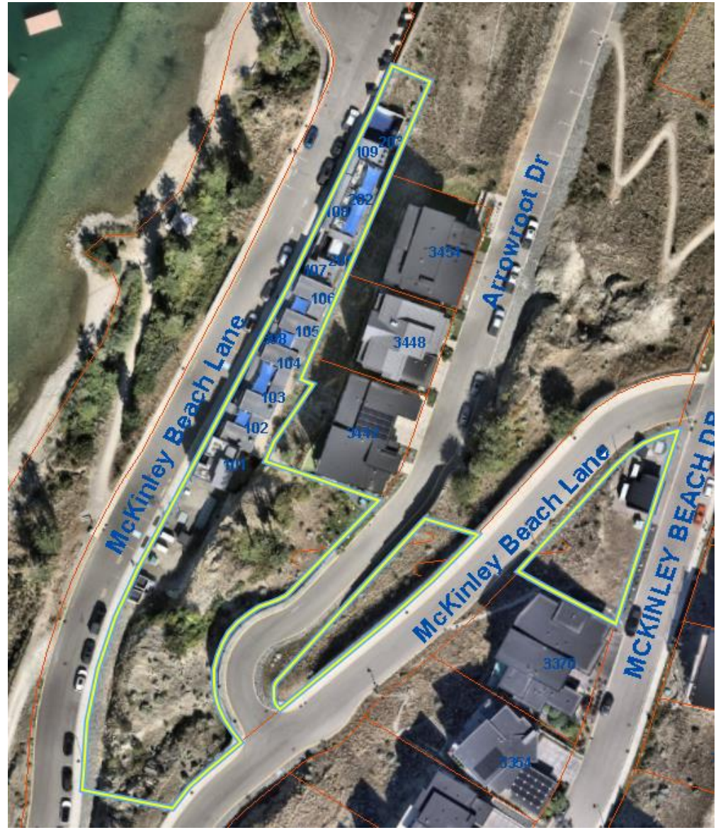
3398 McKinley Beach Lane