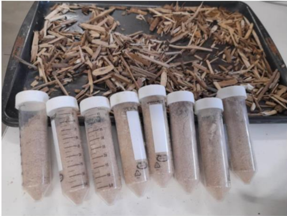
Milled wood chips