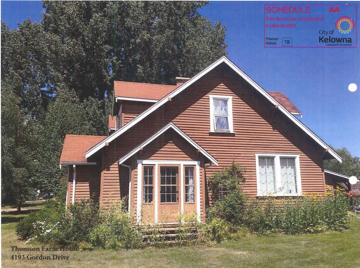
Thomson Farm House 4193 Gordon Drive