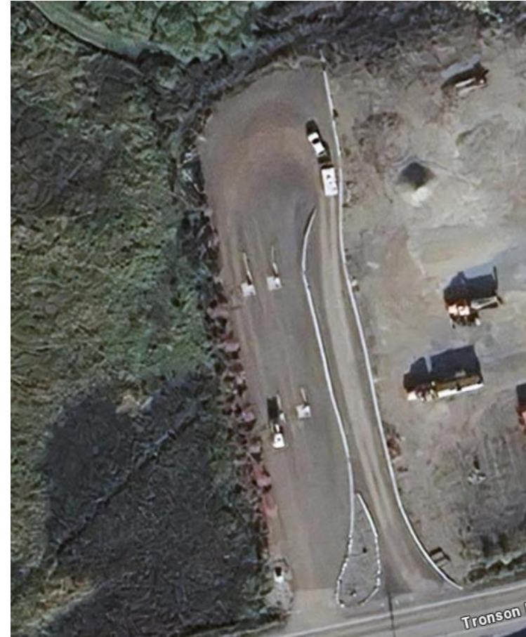
City of Vernon 4 receiving sites