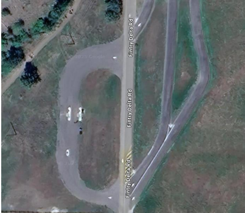
Fintry Provincial Campground 2 receiving sites