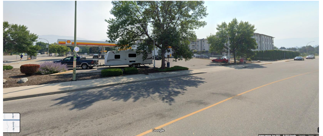
Hwy 33 Shell