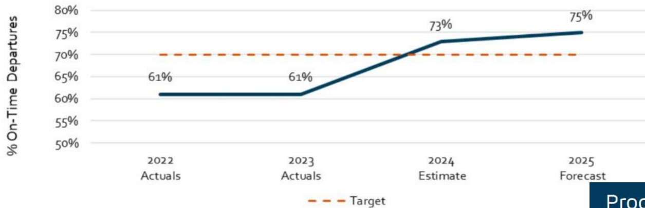
PM#3: On-Time Performance