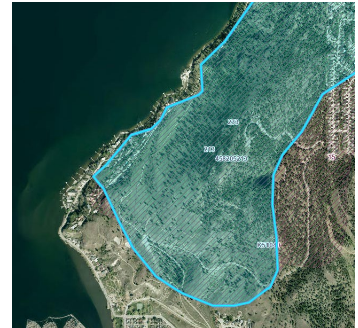
July 2, 1929 Fire Perimeter