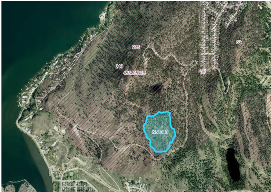
July 1 2023 Fire Perimeter