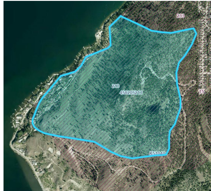
August 17, 1943 Fire Perimeter