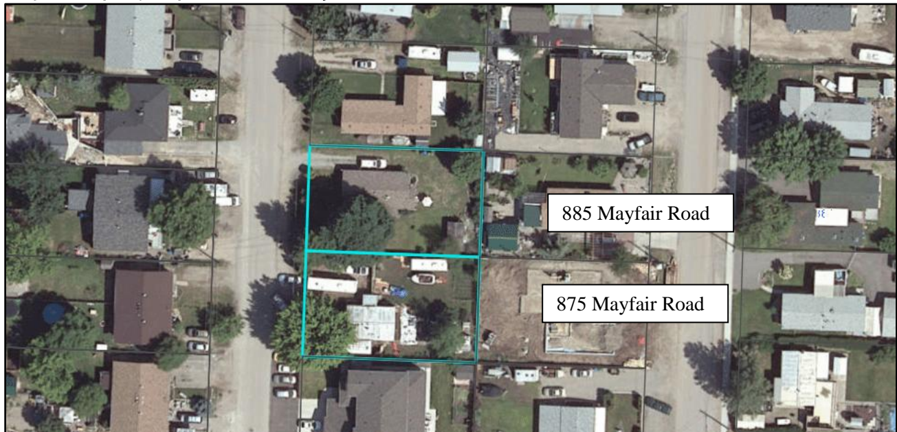
Subject Property Map: 875 & 885 Mayfair Road