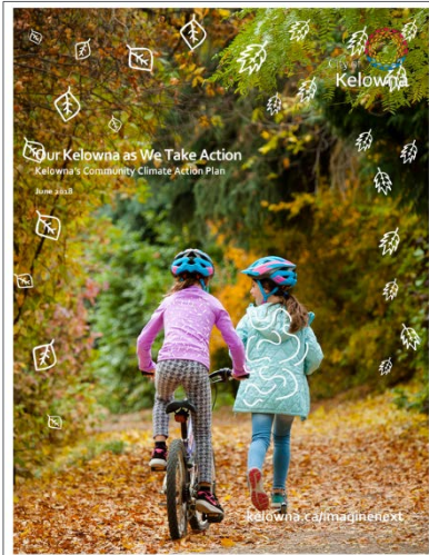
Community Strategy: Kelowna's Community Climate Action Plan (2018)