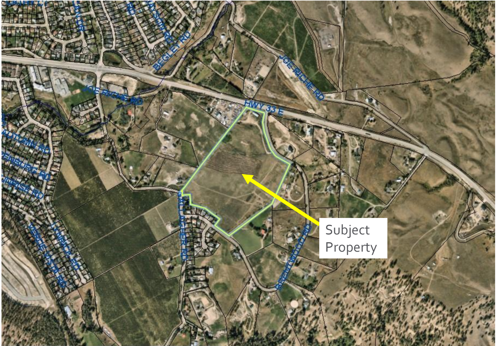
City of Kelowna