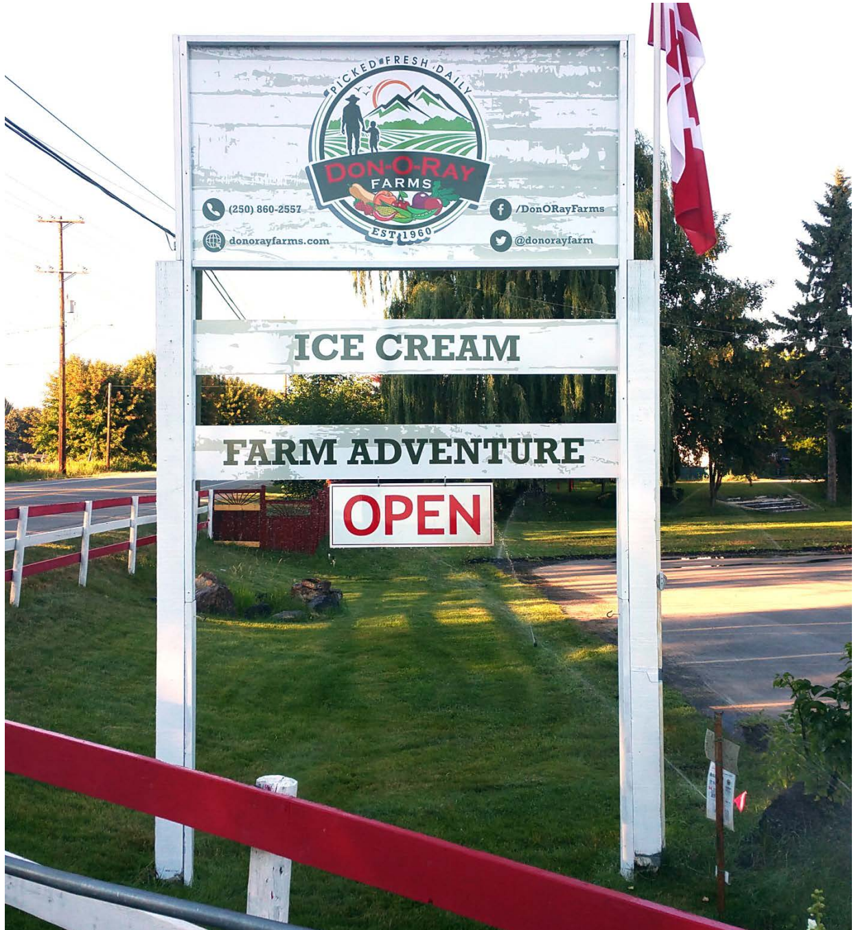
OLD SIGN (Photographed)