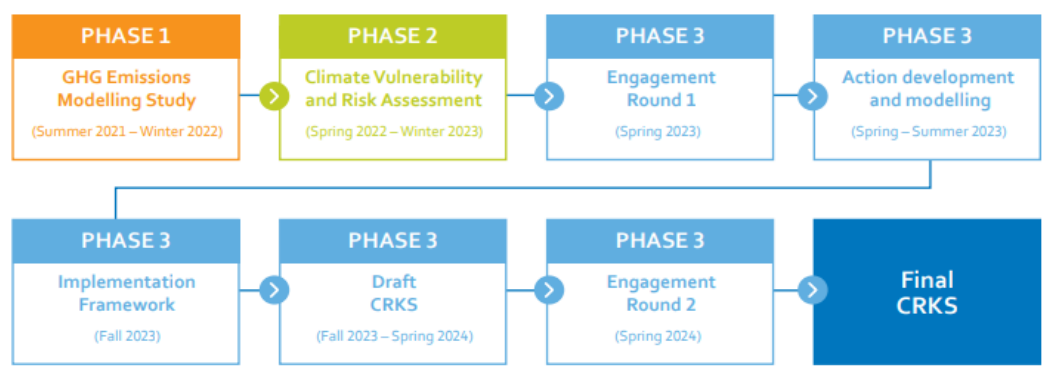
Figure 1: Process for developing the Climate Resilient Kelowna Strategy

The first phase of developing the CRKS began in 2021 to model Kelowna's community GHG emissions and to understand the degree of action that would be needed to align with IPCC recommendations and senior government targets. Following the technical analysis, Council provided the direction to use new community emissions reduction targets (40 per cent below 2007 levels by 2030 and achieve net zero by 2050) in the development of the CRKS. Phase 2 of strategy development involved a Climate Vulnerability and Risk Assessment (CVRA), which was completed throughout 2022 to identify the vulnerabilities and risks Kelowna is exposed to due to a changing climate. The CVRA and GHG emissions modelling study, coupled with input from the public through two rounds of community engagement, shaped the development of the CRKS (Figure 1).