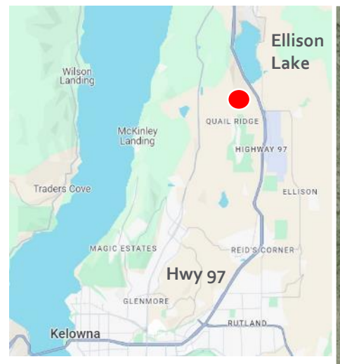
Project site: North Entry Monument