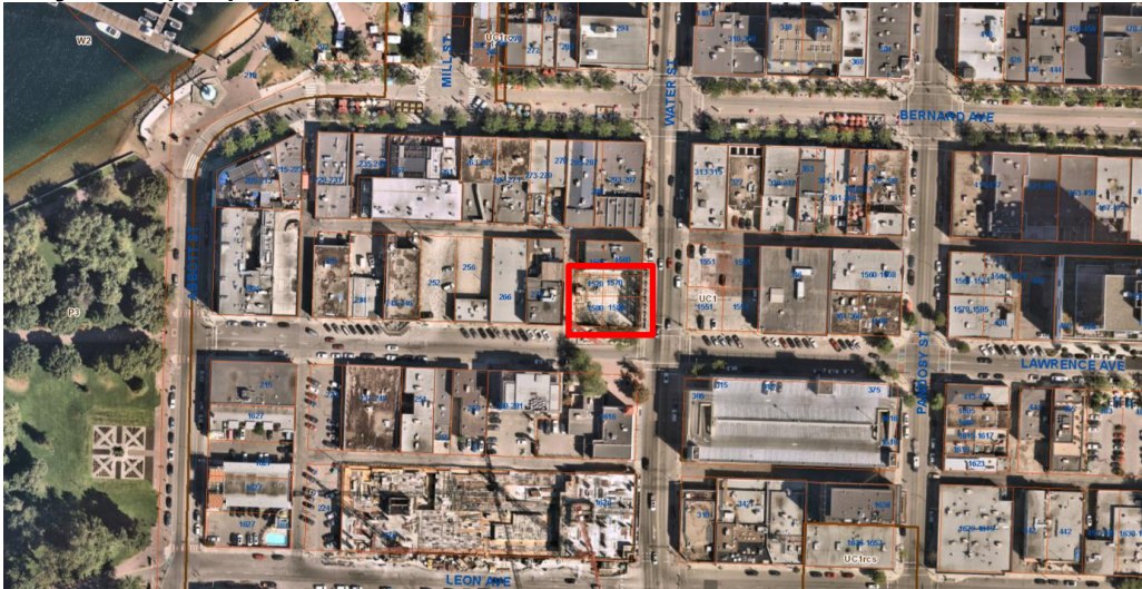
Downtown Context Map: