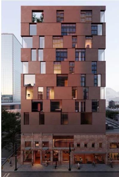
New Development Permit (DP24-0061) April 2024

The original application was for a unique establishment featuring a wine bar; lounge, roof top deck, interpretative centre, tasting room, education centre and lab, and wine shop. The applicant continued with a demolition and building permit to build the structure in December 2020. For provincial regulations and logistical reasons the applicant put the building permit on hold. The partially constructed site has remained fenced off ever since.