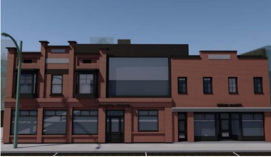
Original Development Permit (DP19-0143) December 2020

stucco applied over it in the post-WWII era. The original 2019 application, where the building was largely demolished, removed the stucco and refurbished the original brick façade facing Water Street.