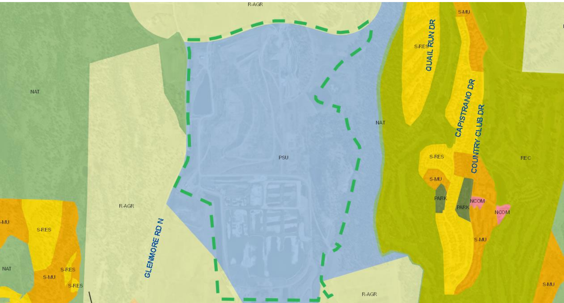
City of Kelowna