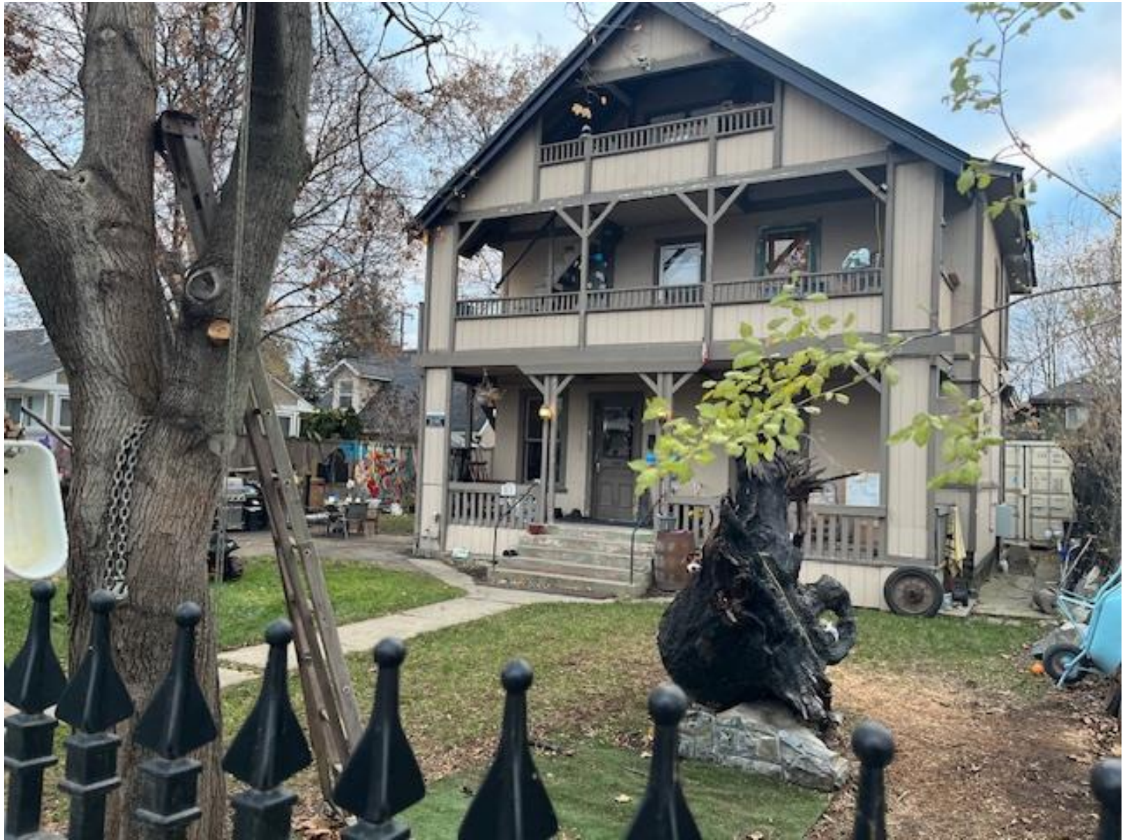
City of Kelowna