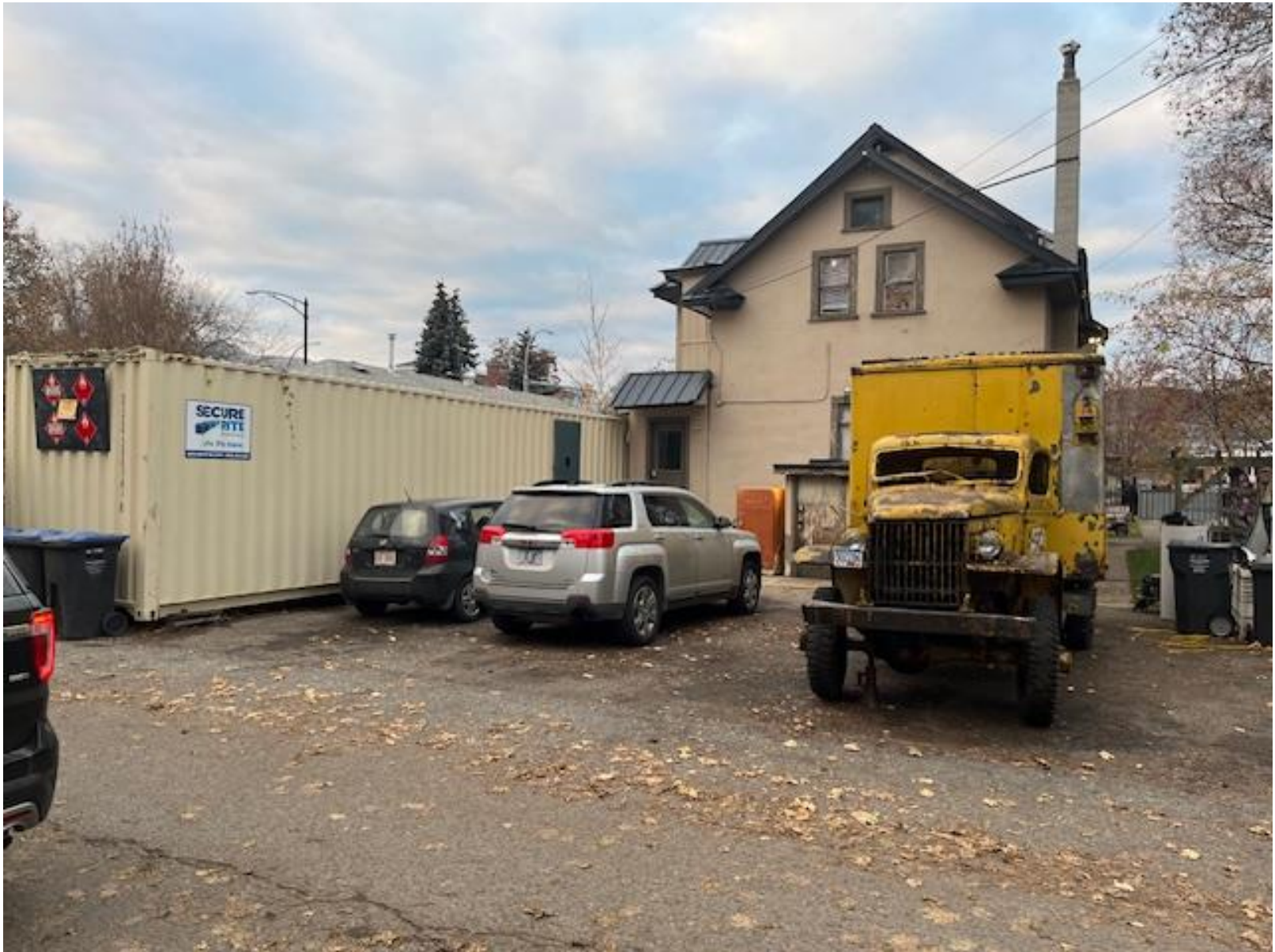
City of Kelowna