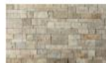
3a - DRYSTACK STONE