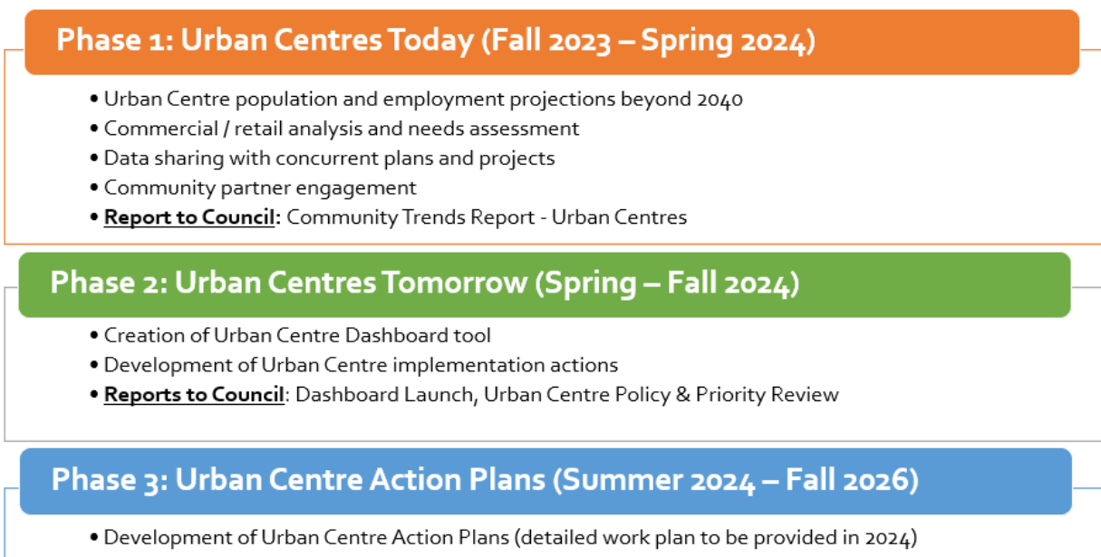
Figure 2: Project Process and Phasing

The process outlined in this report would take place between the remainder of 2023 through to the end of 2026 (see Figure 2).