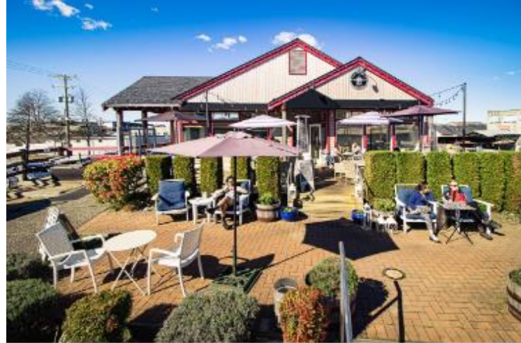
Britannia Brewing Steveston