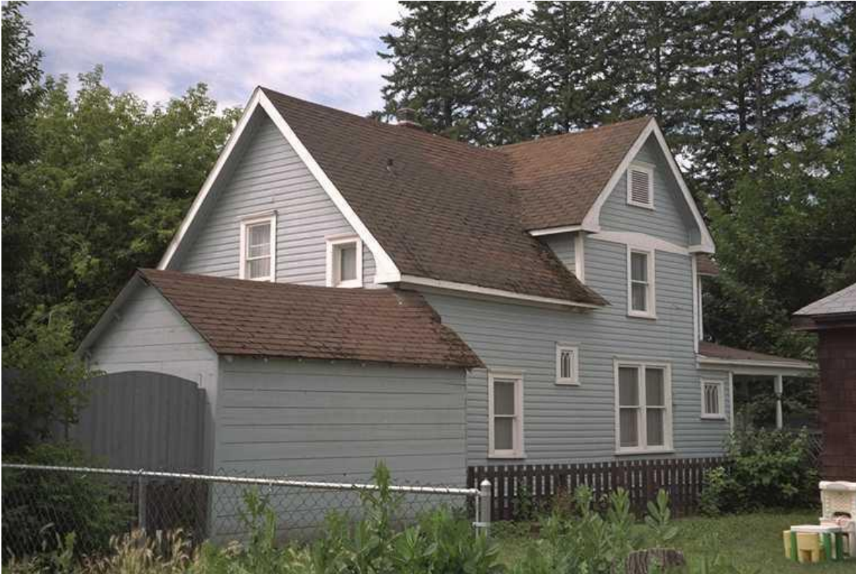
Kelowna Heritage Register, ~2004