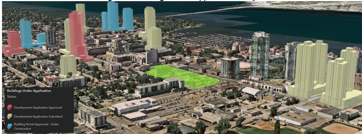
Figure 2: Buildings Under Application (2023)

Many of these proposals are significantly higher than the 26 storeys signaled in that area and rationalized in accordance with Policy 4.4.3 of the 2040 OCP (outlined below). Given the shifting height profile of these projects, the 20 storey heights currently signaled in the OCP along Ellis Street would now result in a more sudden height transition than anticipated when the 2040 OCP was being developed.