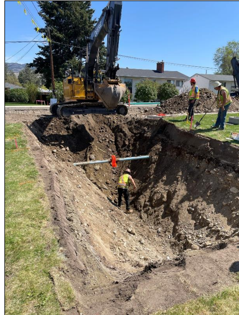
Figure 2: Photo of excavated service trench in Central Rutland Sewer Connection Area.