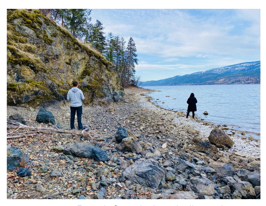
Beach front being dedicated