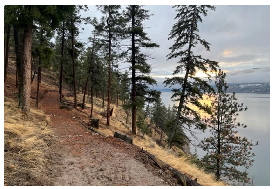
Existing informal trail