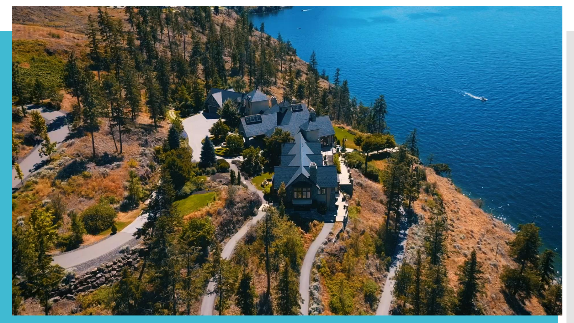
380 Lochview Road

Text Amendment to expand the Bed and Breakfast use.