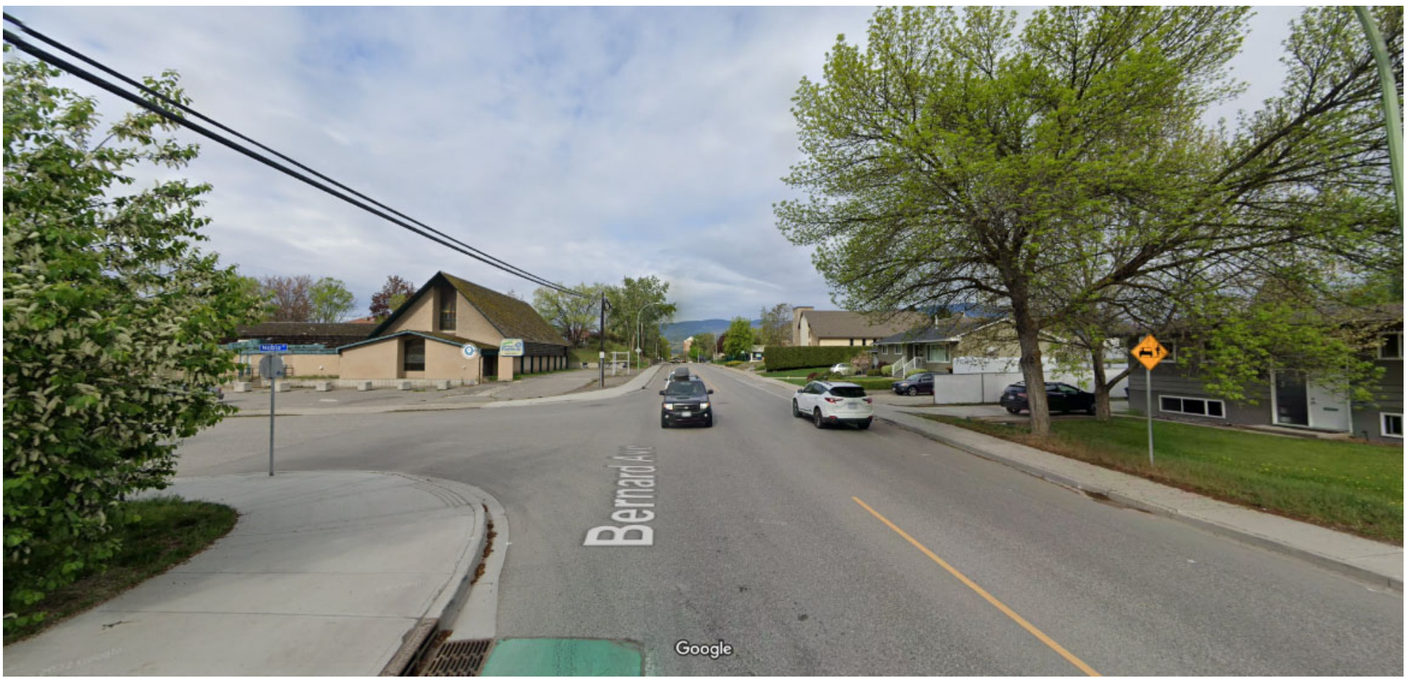
VIEW FROM BERNARD AVENUE - LOOKING WEST