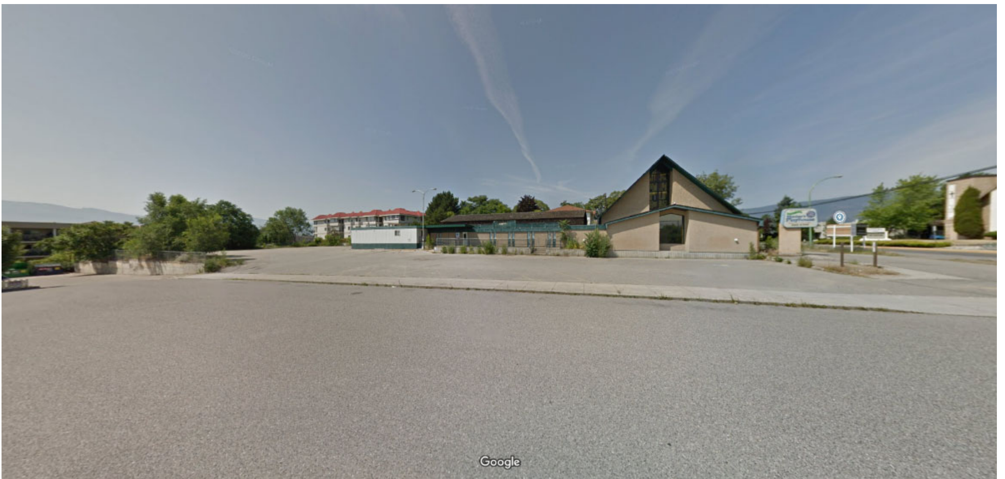
VIEW FROM NOBLE COURT - LOOKING WEST