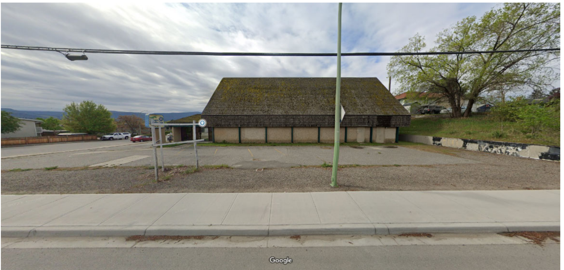
VIEW FROM BERNARD AVENUE - LOOKING SOUTH