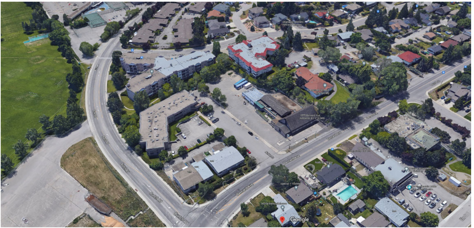
AERIAL VIEW - LOOKING SOUTH WEST