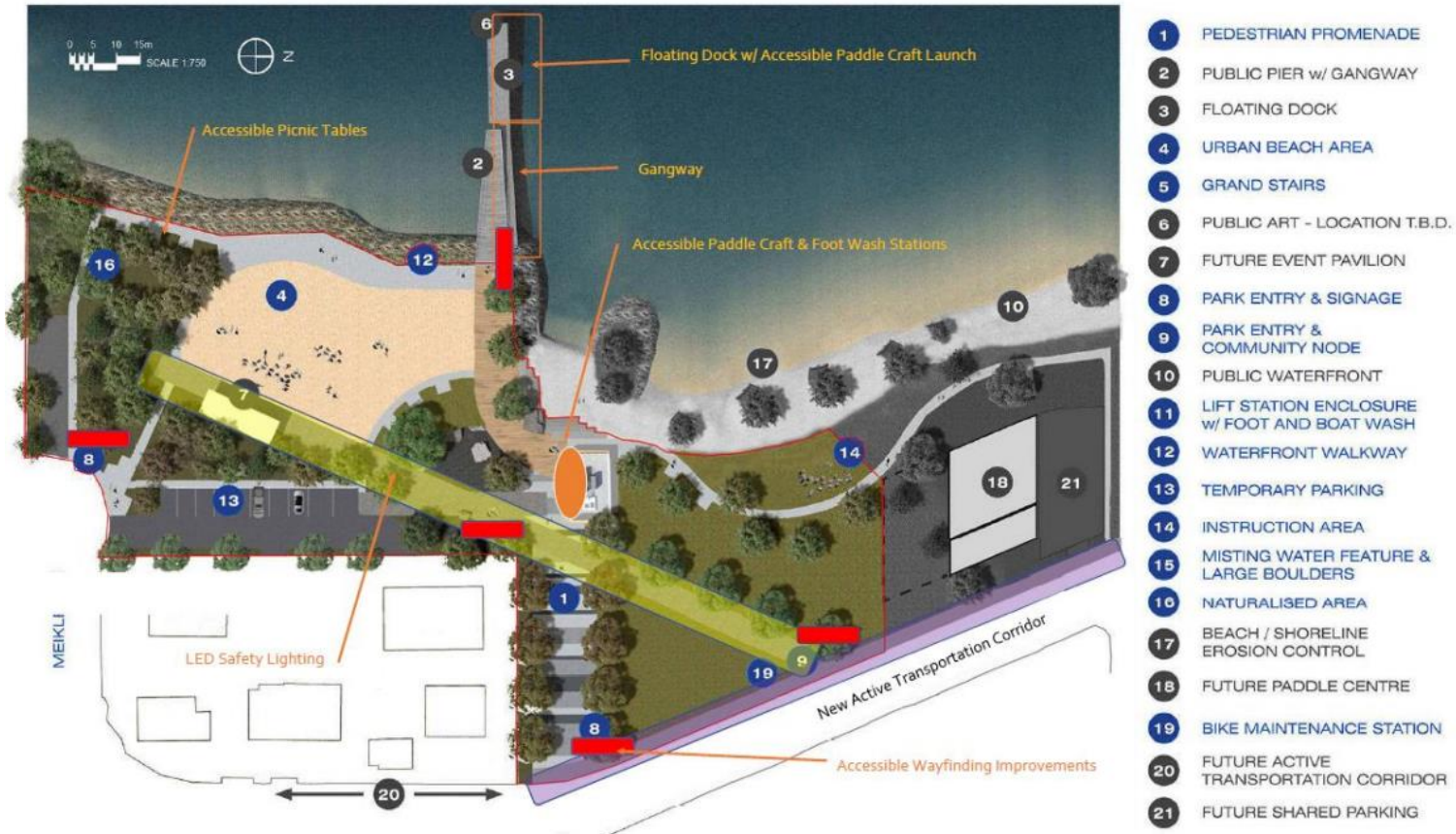
CCRF Grant Improvements Site Plan – Pandosy Waterfront Park, Kelowna