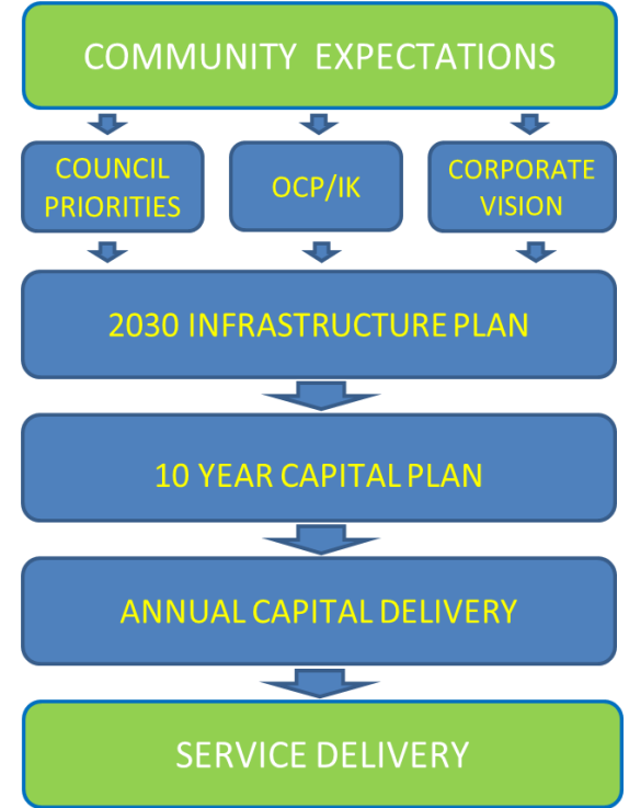
Figure 1- Capital Planning Continuum.

The City's infrastructure planning process starts with understanding community expectations and ends with providing infrastructure that delivers the expected services to the community. The 2030 Infrastructure Plan set the direction for infrastructure investment until 2030 and is the City's strategic capital plan linking the higher-level planning/priority documents (i.e. Council and Corporate Priorities, Imagine Kelowna, and the Official Community Plan) with the 10-Year Capital Plan and the Annual Budget. Recognizing that emerging issues and community priorities change, the 10-Year Capital Plan is updated annually to respond to these changing conditions. The capital projects in the Annual Budget are, in turn, directed by the 10-Year Capital Plan and in the end, these plans lead to public infrastructure that supports services the community depends on.