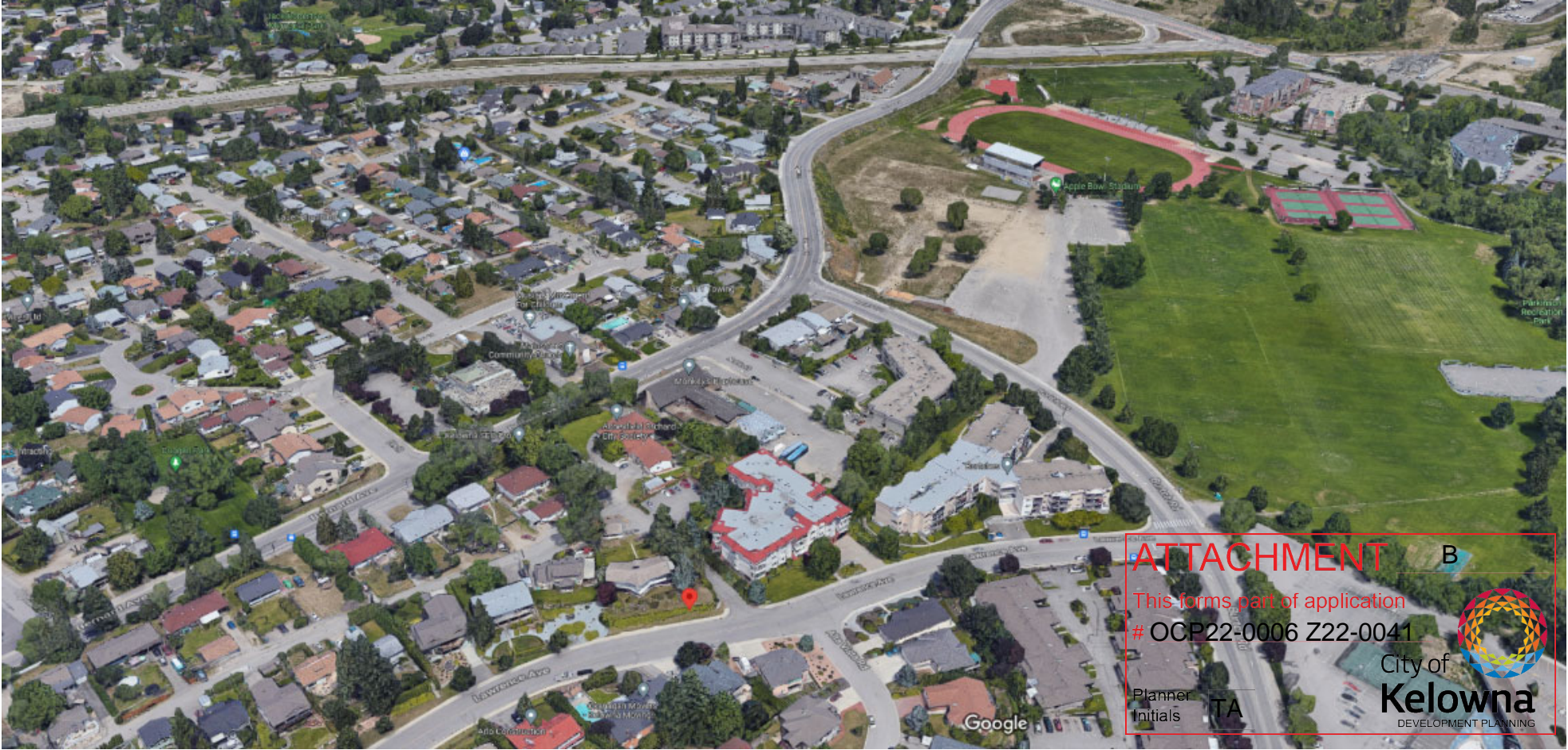
AERIAL VIEW - LOOKING NORTH EAST