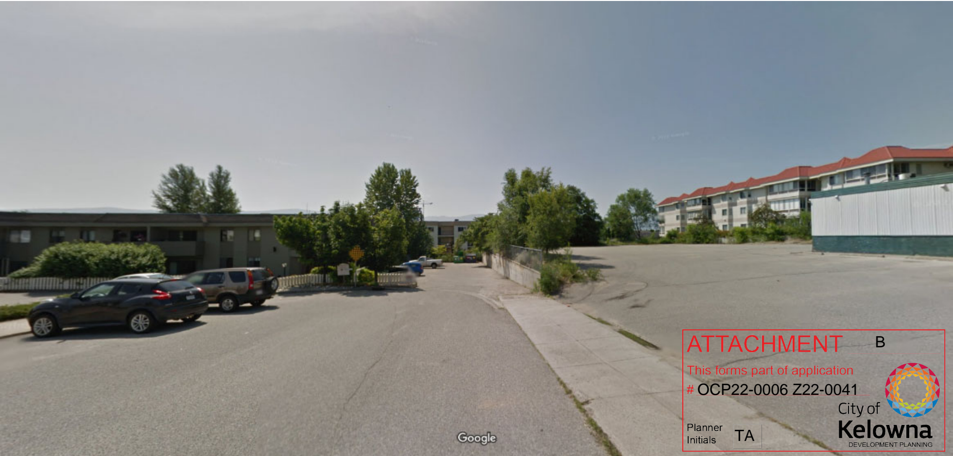
VIEW FROM NOBLE COURT - LOOKING SOUTH