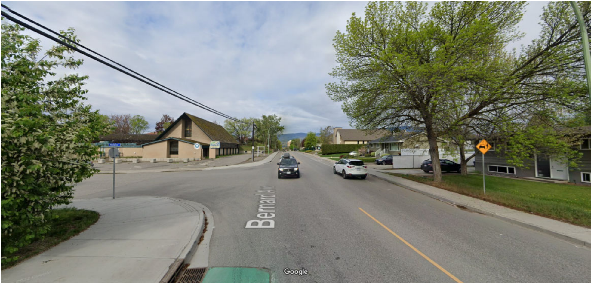
VIEW FROM BERNARD AVENUE - LOOKING WEST