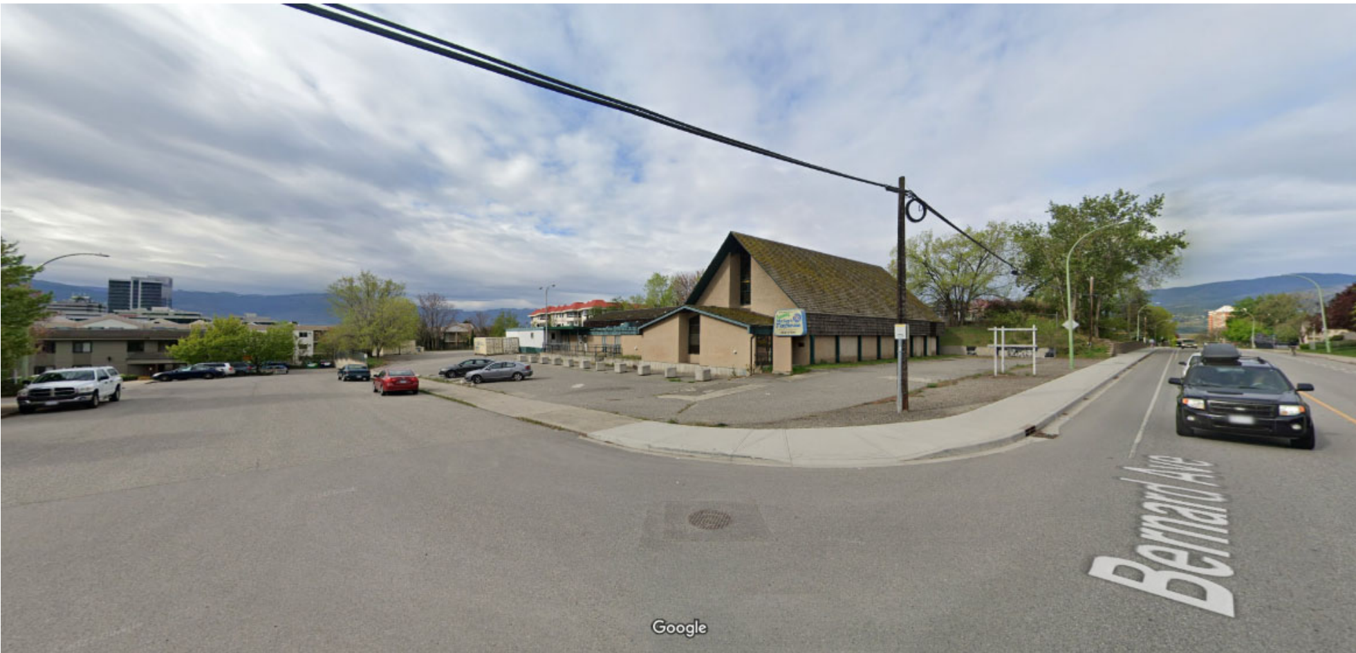
VIEW FROM CORNER OF BERNARD & NOBLE - LOOKING SOUTH WEST