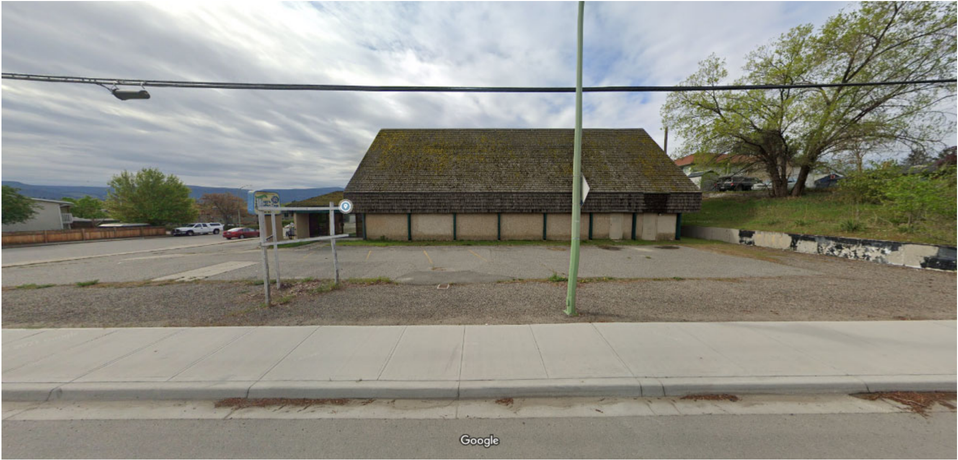
VIEW FROM BERNARD AVENUE - LOOKING SOUTH