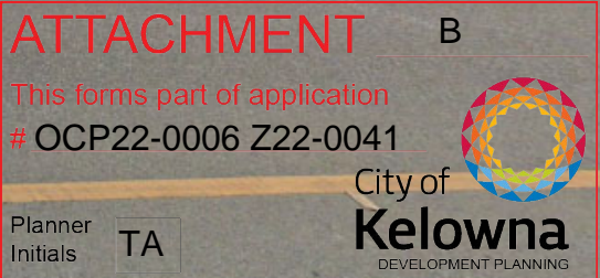
VIEW FROM BERNARD AVENUE - LOOKING NORTH