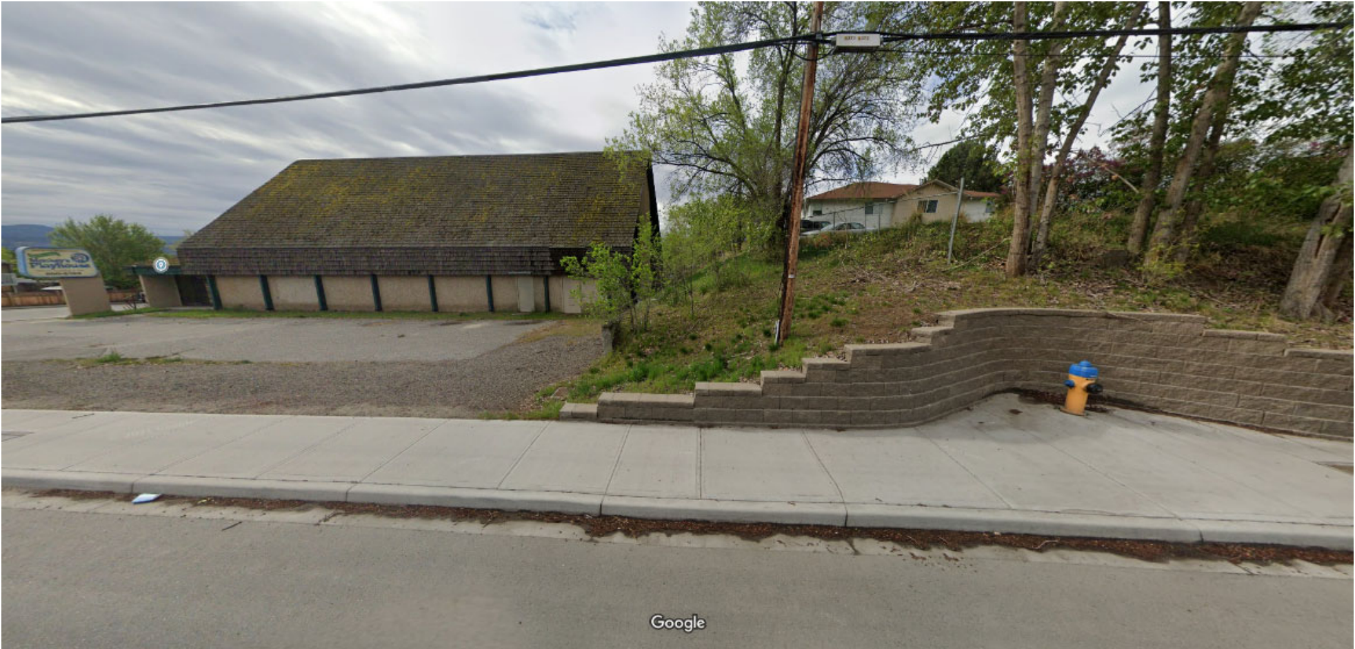
VIEW FROM BERNARD AVENUE - LOOKING SOUTH