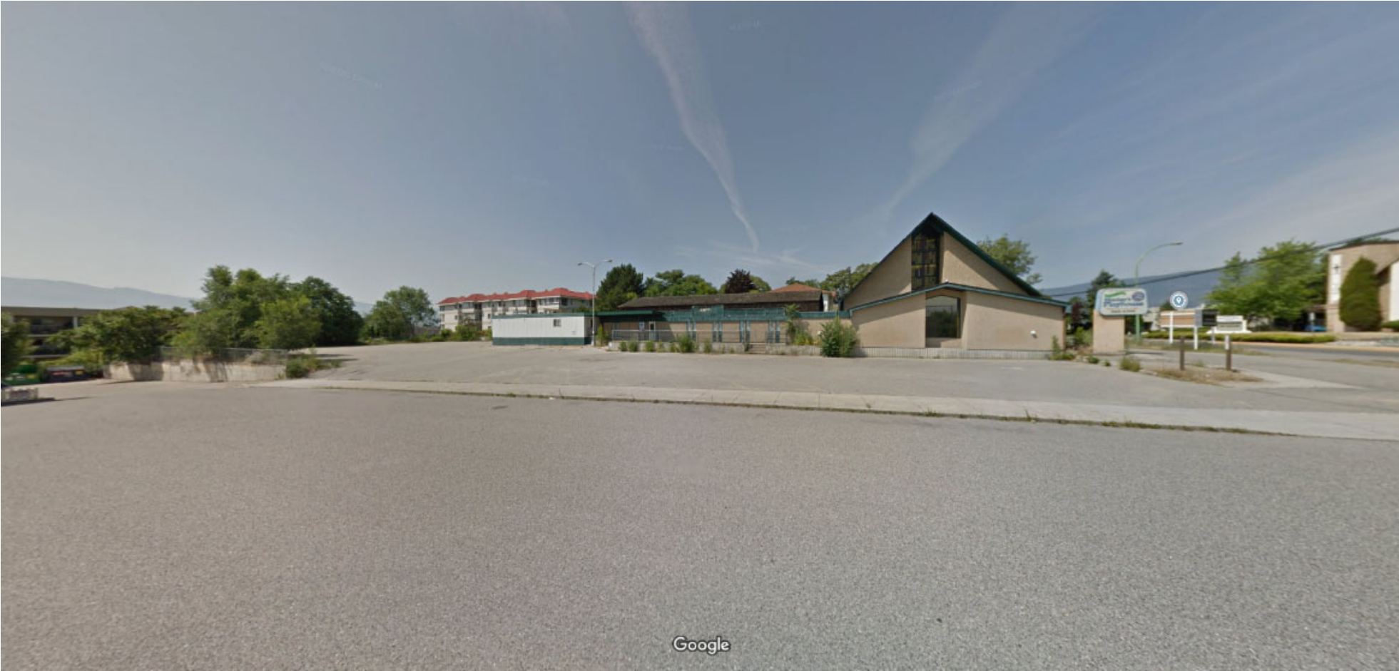
VIEW FROM NOBLE COURT - LOOKING WEST