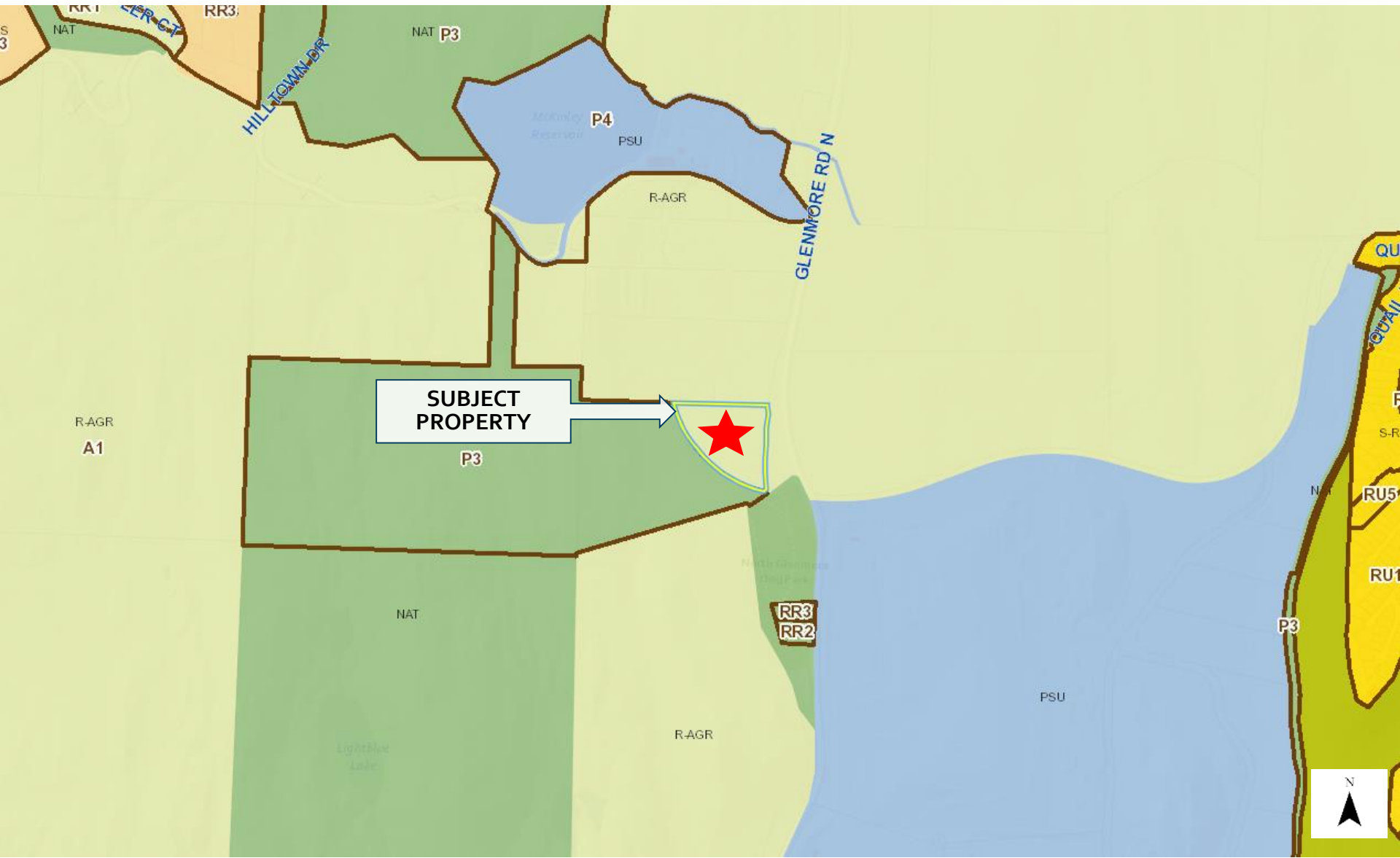
City of Kelowna