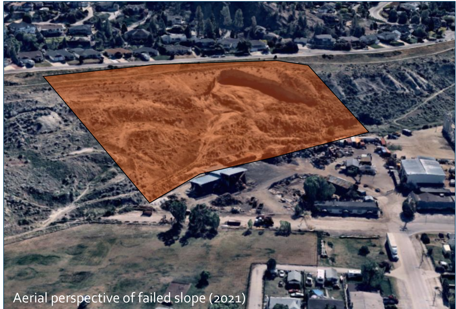
Aerial perspective of failed slope (2021)