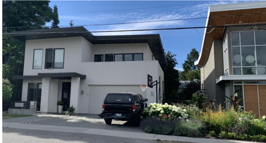
685 McClure Road – lot width of 16.12m