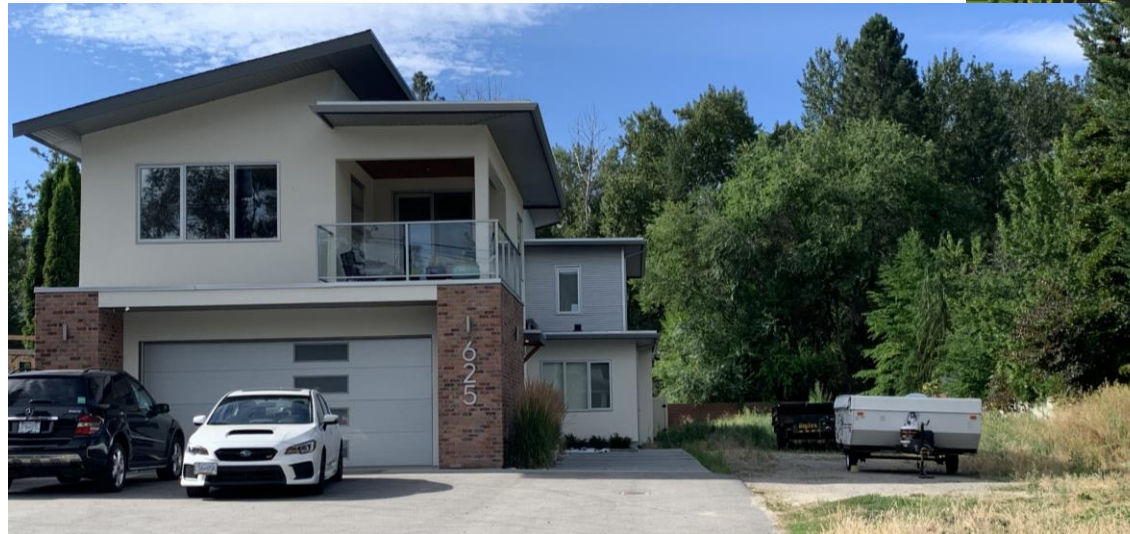
621 & 625 McClure Road – lot width of 13.71m each

Neighbouring properties 663 & 667 McClure Road (not shown) have a lot width of 13.72m & 13.73m.