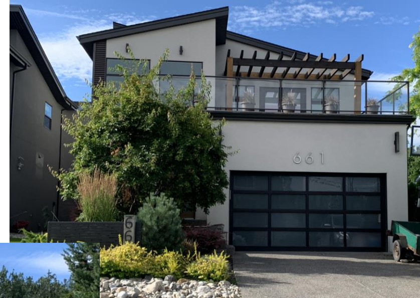
661 McClure Road – lot width of 13.72m.