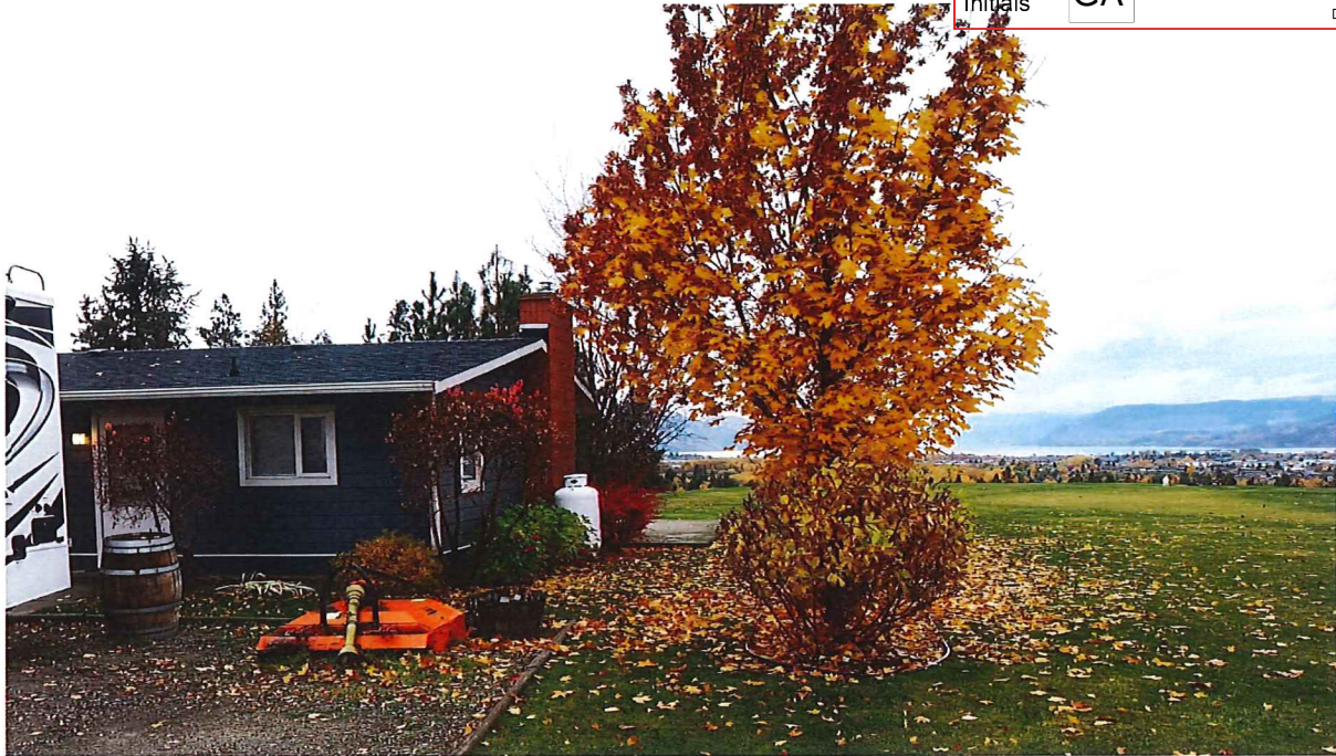
Above: View facing Southwest, showing existing farm house (RV parked in front) and big grassy area where wine production building is proposed and approved by ALR.