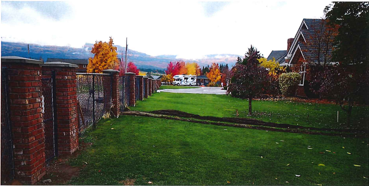
Above: View facing South. RV is parked in front of farm worker house in its existing location in the distance. This photo is taken where new location is proposed. Fence will be taken down and ring road is on other side around the edge of the vineyard. (don't mind the grass, that was for irrigation repairs). The main single family residence is also visible.