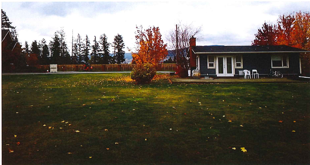
Above: View facing Northeast. You can see the back of the farm worker house in it's current location and it's general size. Vineyard is in background as well as a bit of the roofline of the main single family home.