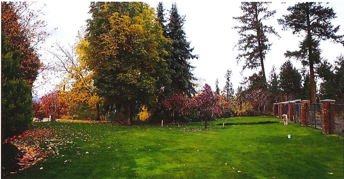
Above: View facing North. Future farm worker house proposed location, tucked right up to trees and fence line. The side of the family home facing this area has virtually no windows so the privacy of both homes will be intact. The septic is located under the grass closer to the family home.