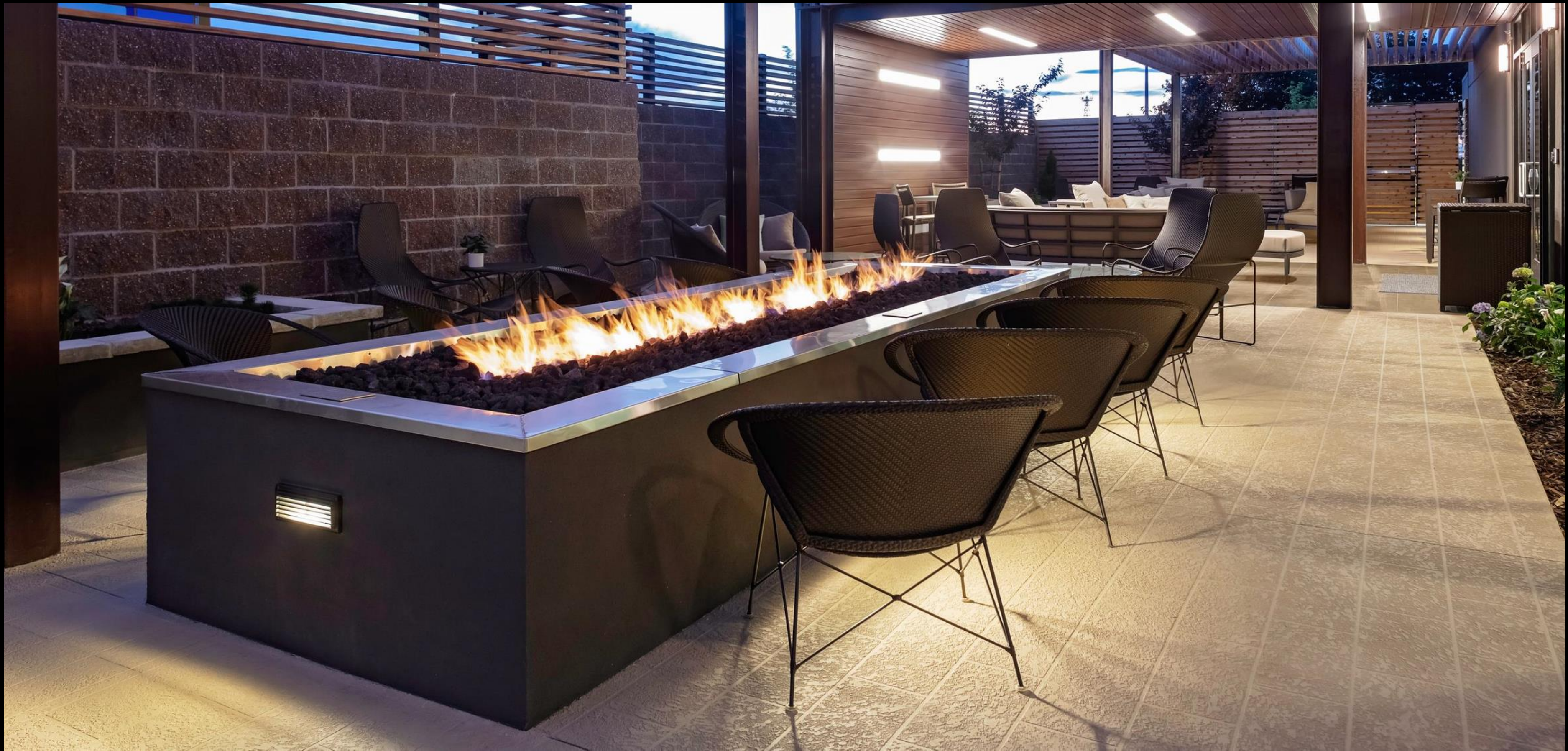
COURTYARD PASCO TRI-CITIES AIRPORT PASCO, WA