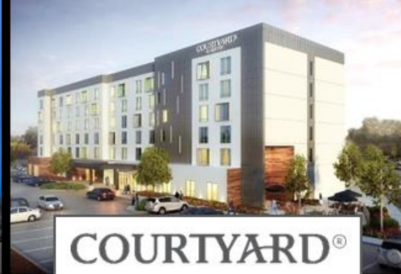
COURTYARD ® Marriott ®