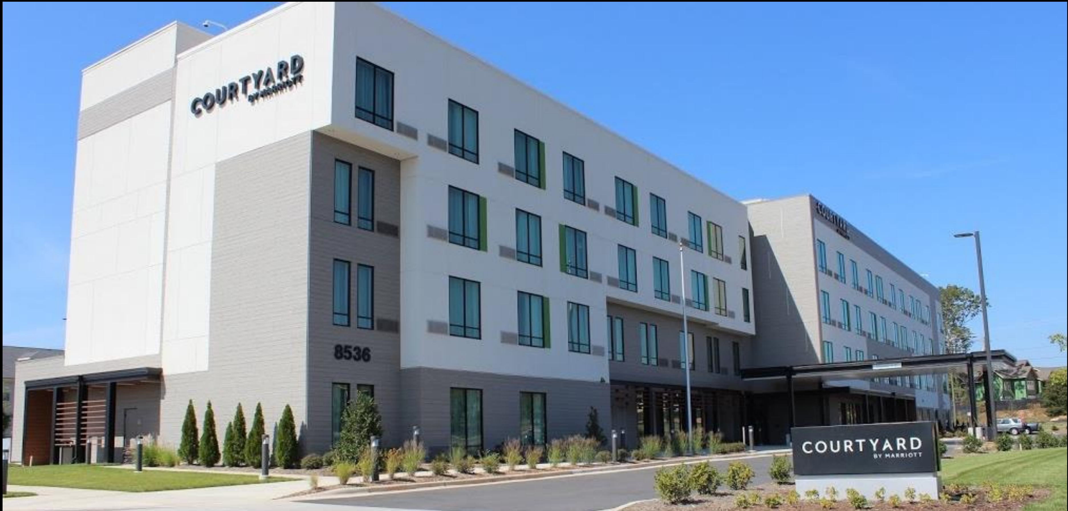
COURTYARD CHARLOTTE STEELE CREEK CHARLOTTE, NC