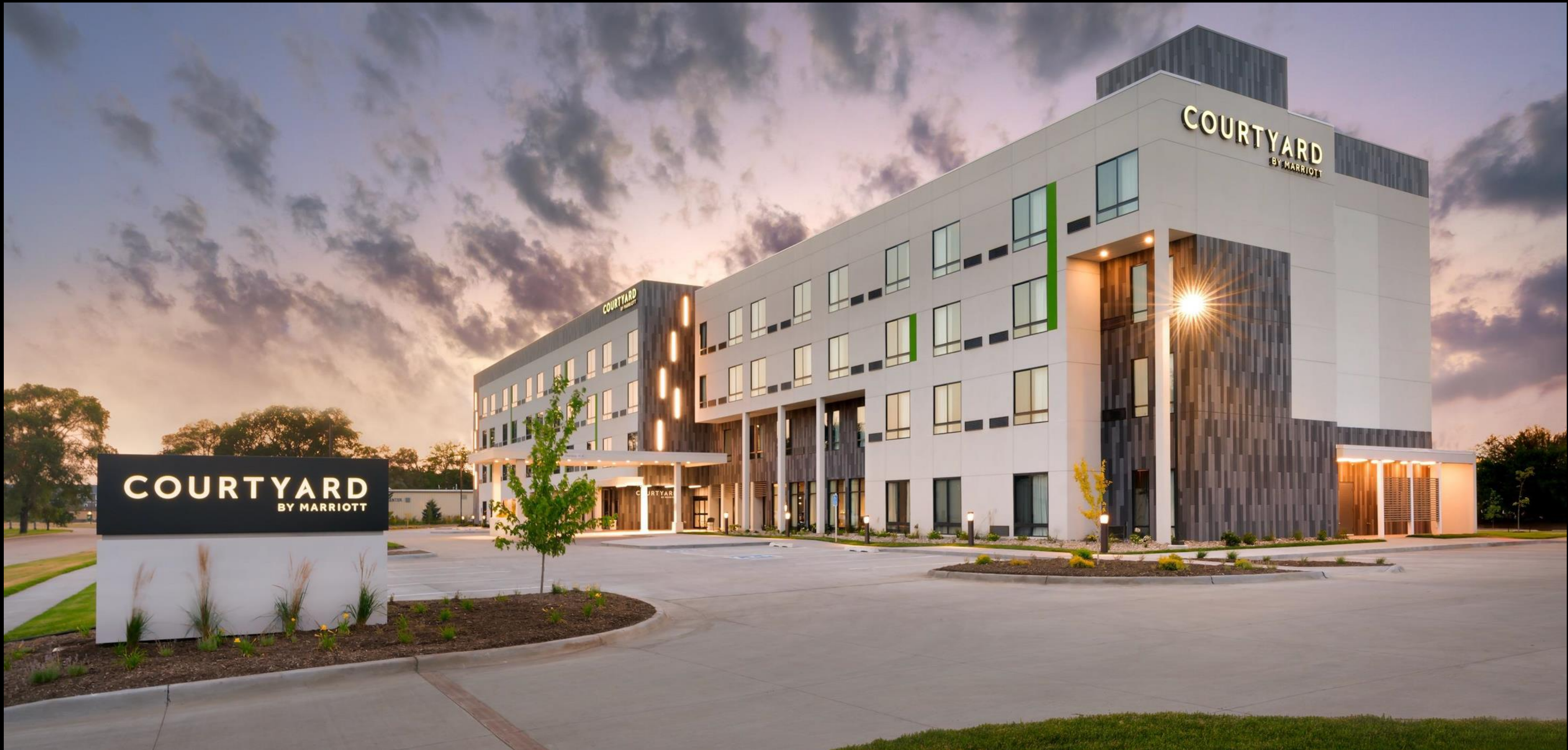
COURTYARD AMES AMES, IA