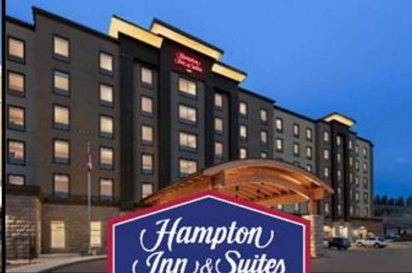
Hampton Inn & Suites by HILTON