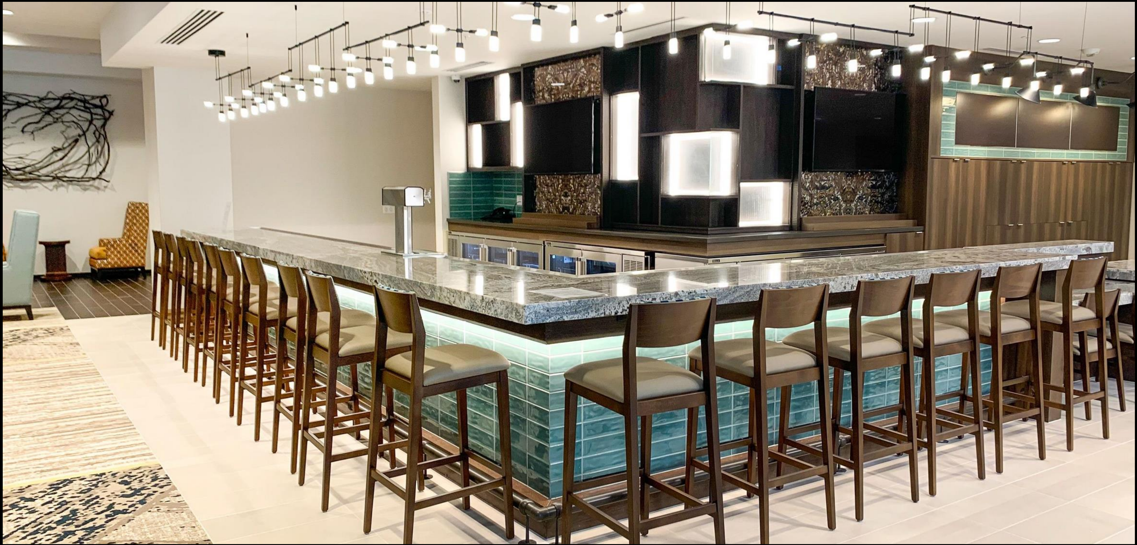
COURTYARD THOUSAND OAKS AGOURA HILLS AGOURA HILLS, CA