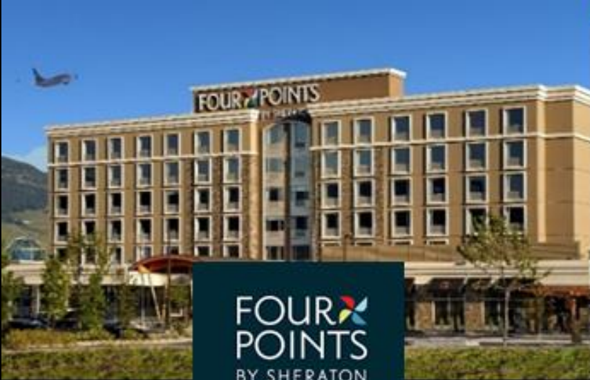
FOUR POINTS BY SHERATON Kelowna Airport