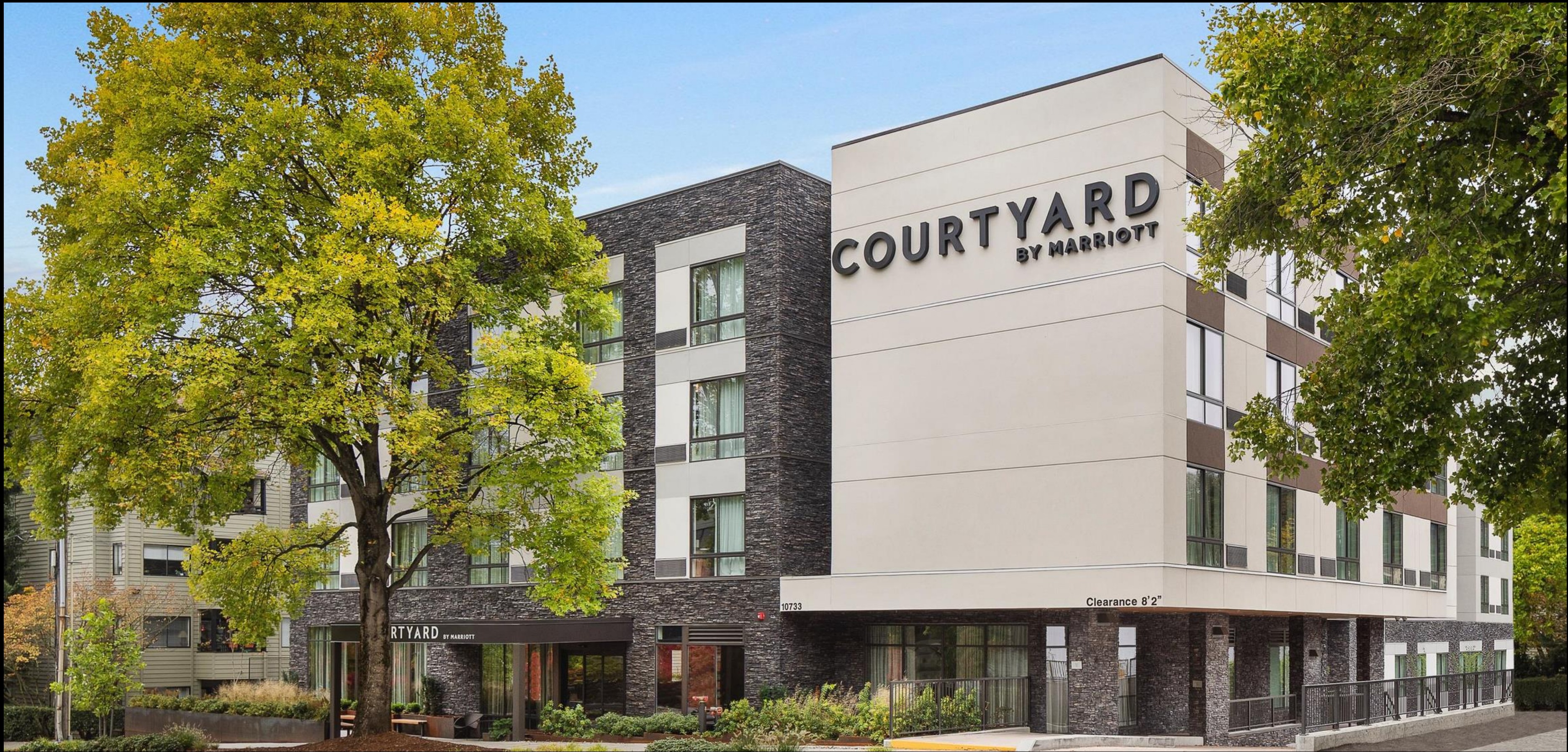
COURTYARD SEATTLE NORTHGATE SEATTLE, WA