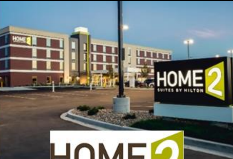
HOME 2 SUITES BY HILTON