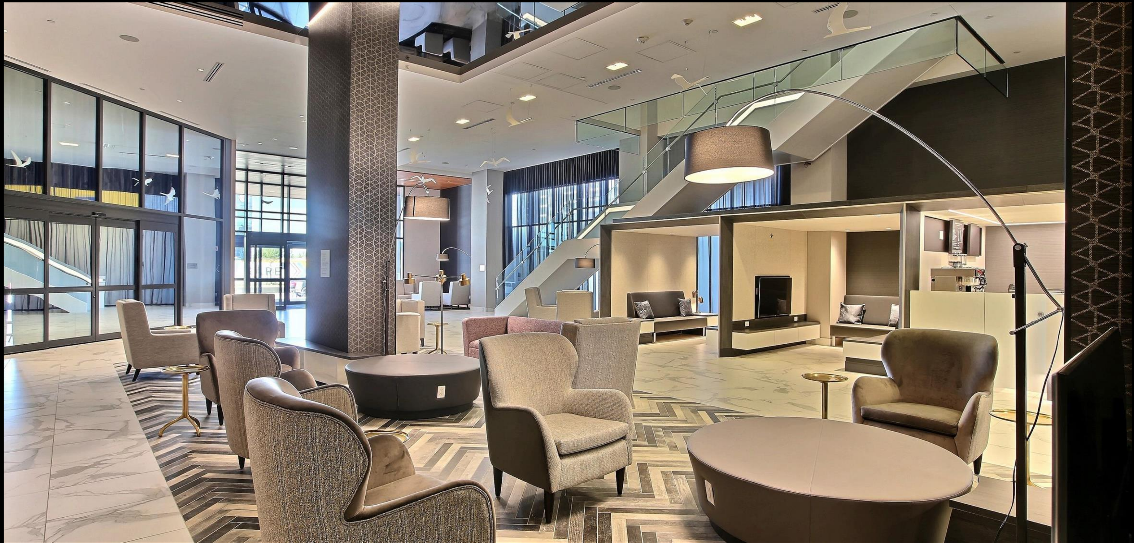
COURTYARD MONTREAL BROSSARD BROSSARD, QUEBEC