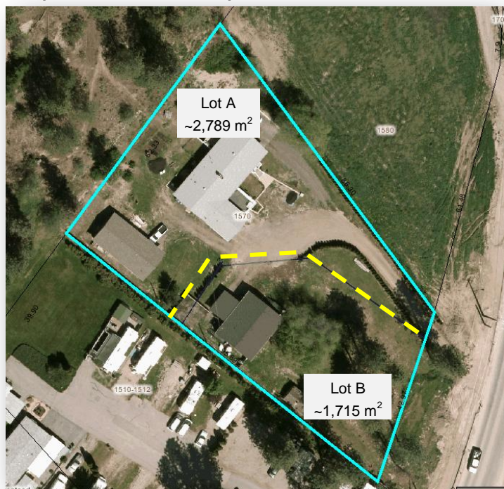
Proposed Subdivision Map

The applicant is proposing to rezone the subject parcel to RR3 in order to subdivide into two RR3 zoned lots. This will result in each of the existing dwellings existing on their own RR3 zoned lots. Both of the proposed lots will be accessed from Glenmore Road N from the existing driveway location on the proposed Lot A. This is required for safety reasons as the subject property is near the intersection of Glenmore Road N and John Hindle Drive. No variances are triggered as a result of the rezoning or proposed subdivision.