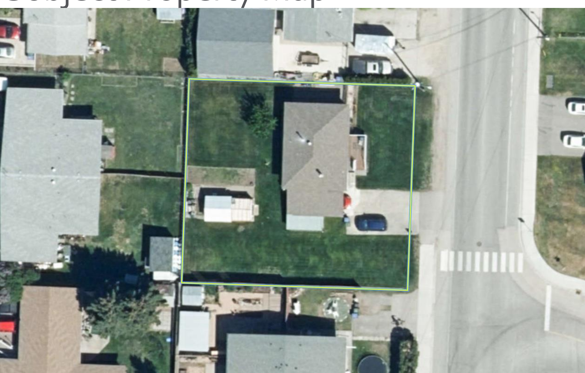
City of Kelowna