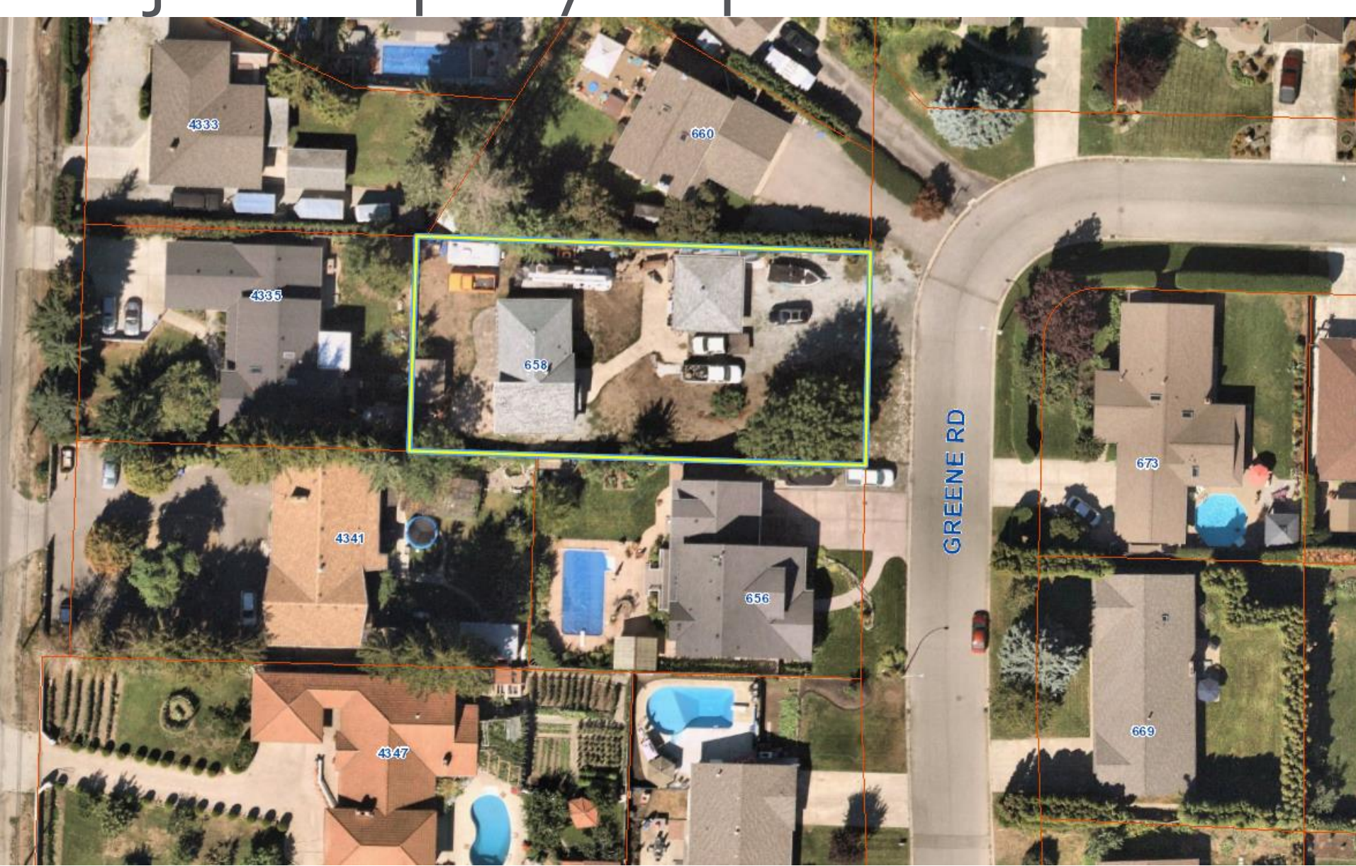
City of Kelowna