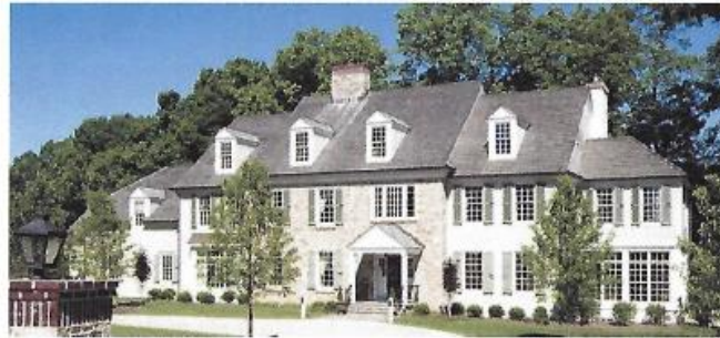
Georgian Revival Traditional Elements applied to contemporary house plans