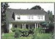
A rare example on Riverside Avenue.