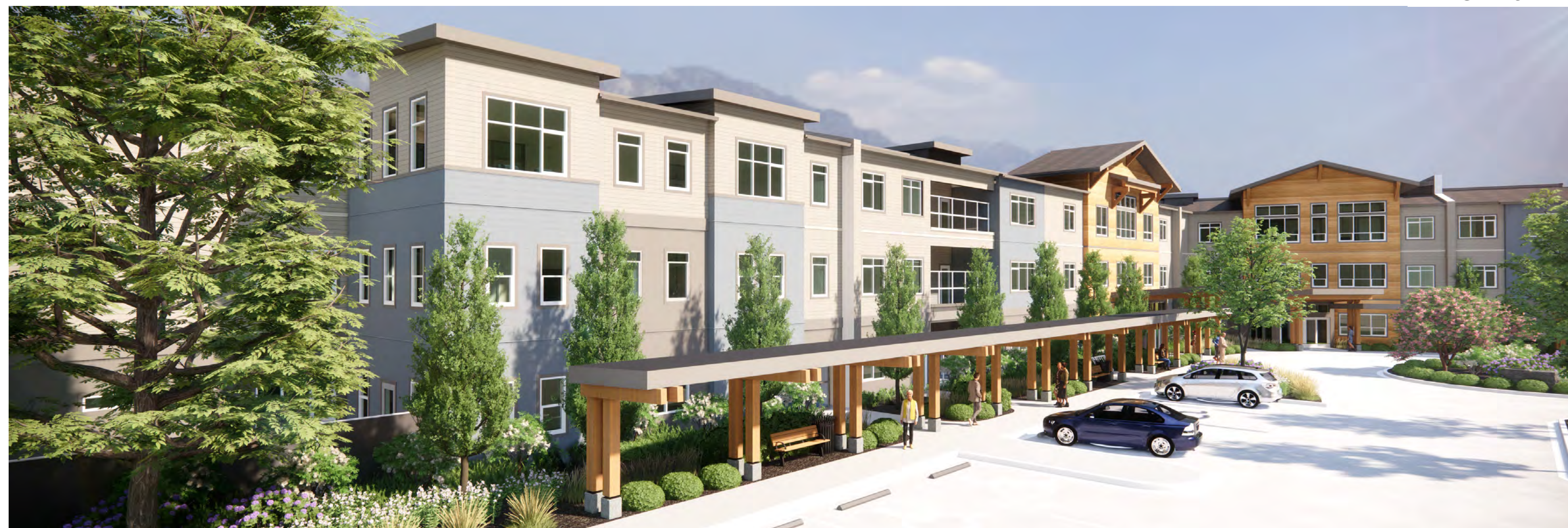
PERSPECTIVE - NORTHWEST VIEW - HOUSES D&F