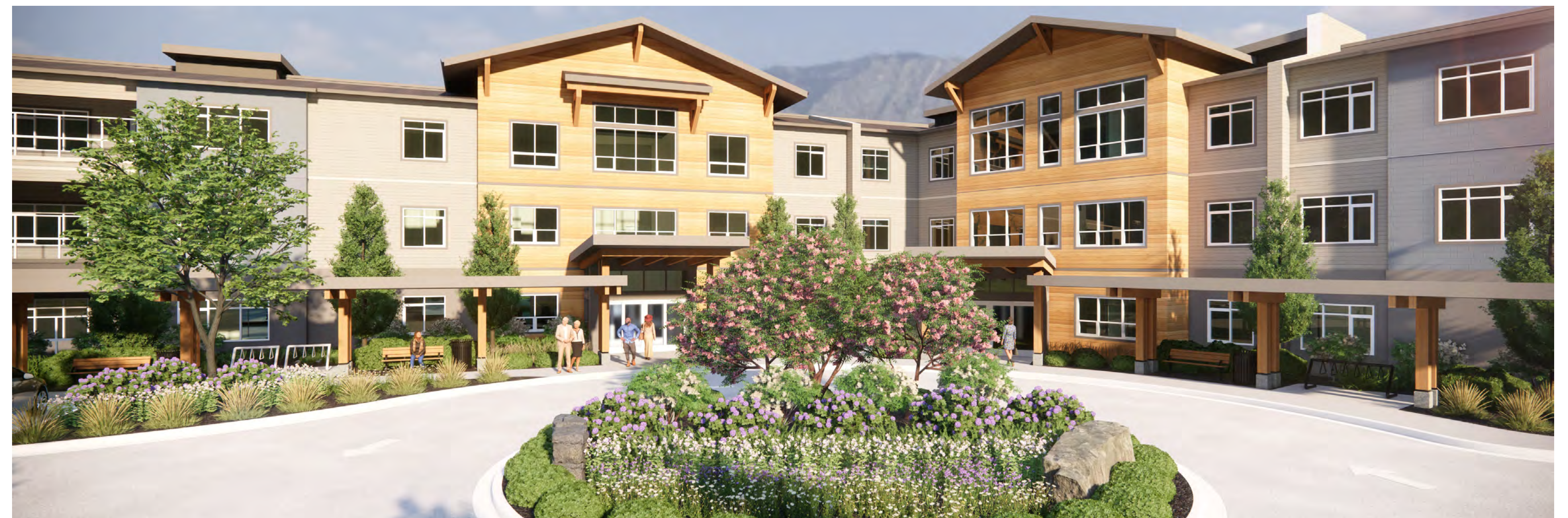
PERSPECTIVE - WEST VIEW - MAIN ENTRY