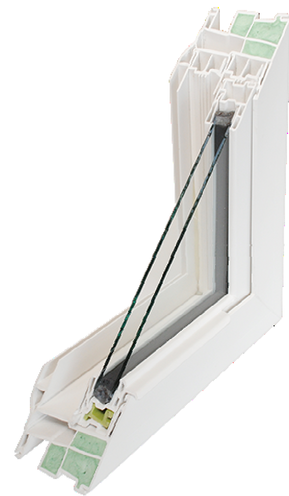
WINDOWS - WHITE VINYL