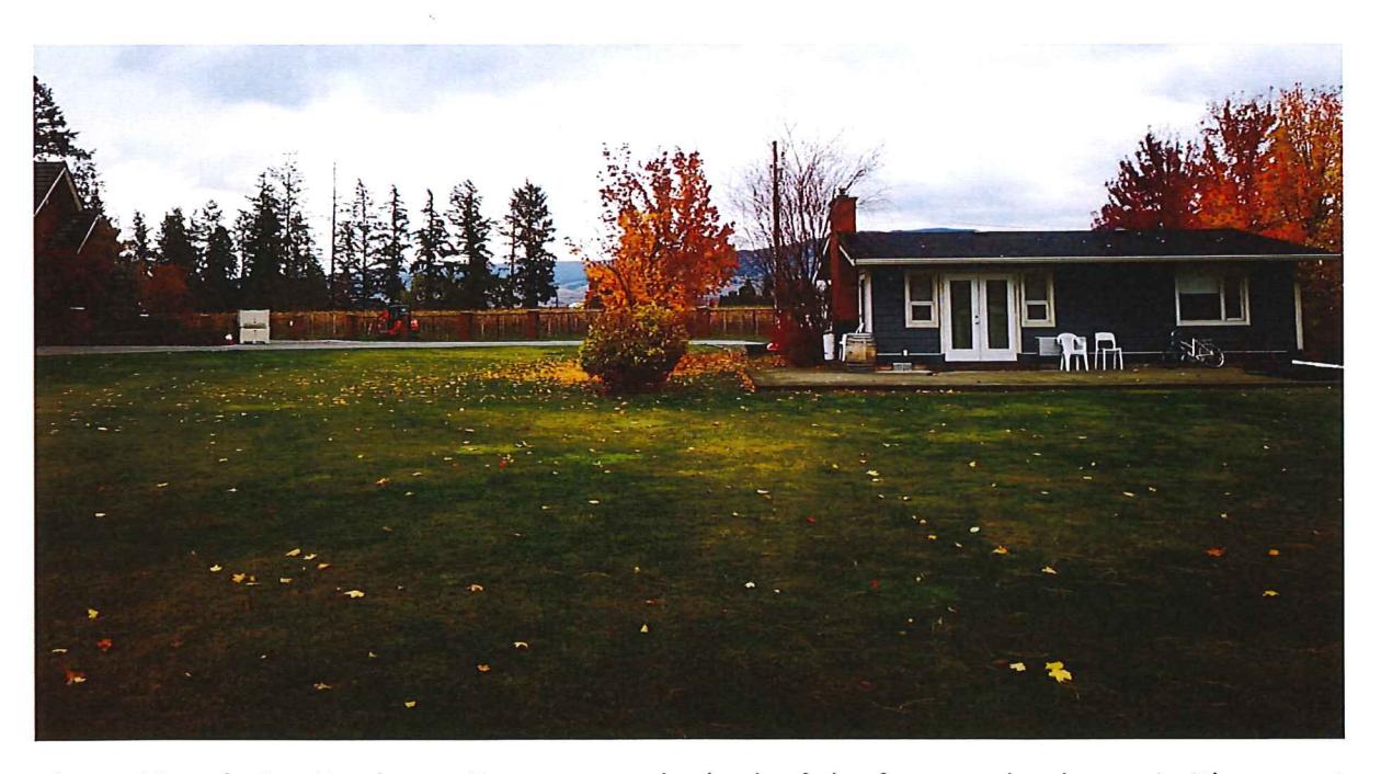
Above: View facing Northeast. You can see the back of the farm worker house in it's current location and it's general size. Vineyard is in background as well as a bit of the roofline of the main single family home.