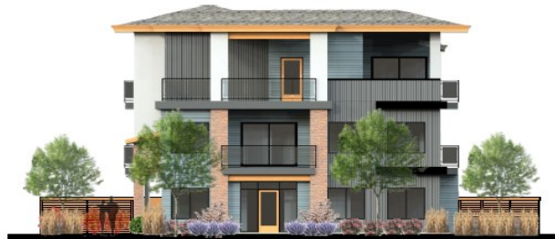
Schematic Front Elevation