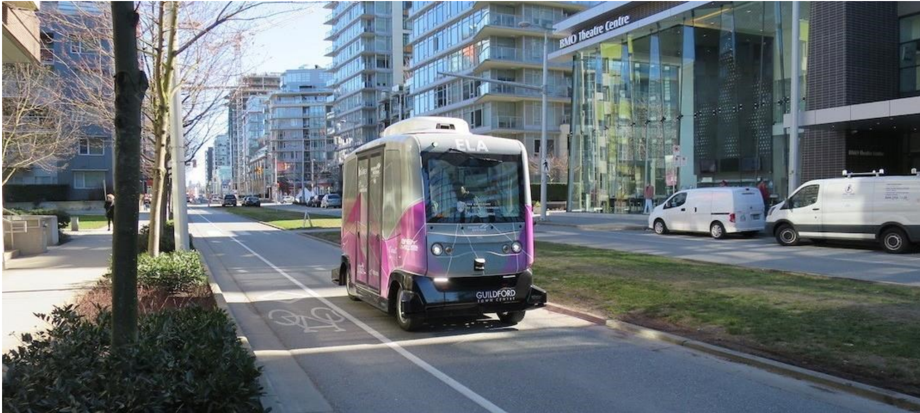
EasyMiles' EZ10 driverless shuttle in Vancouver's Olympic Village, 2019.